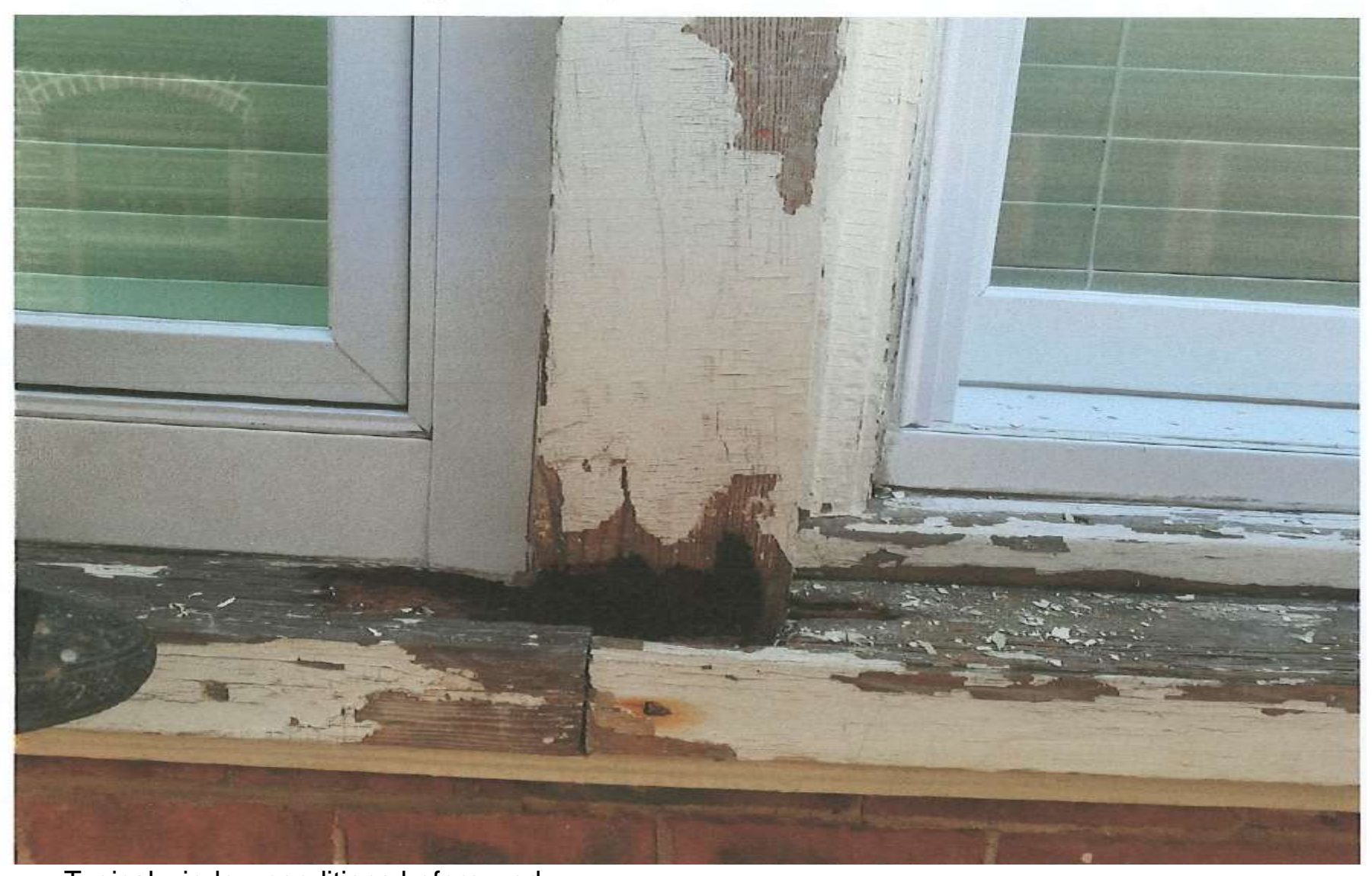
Typical window conditions before work.