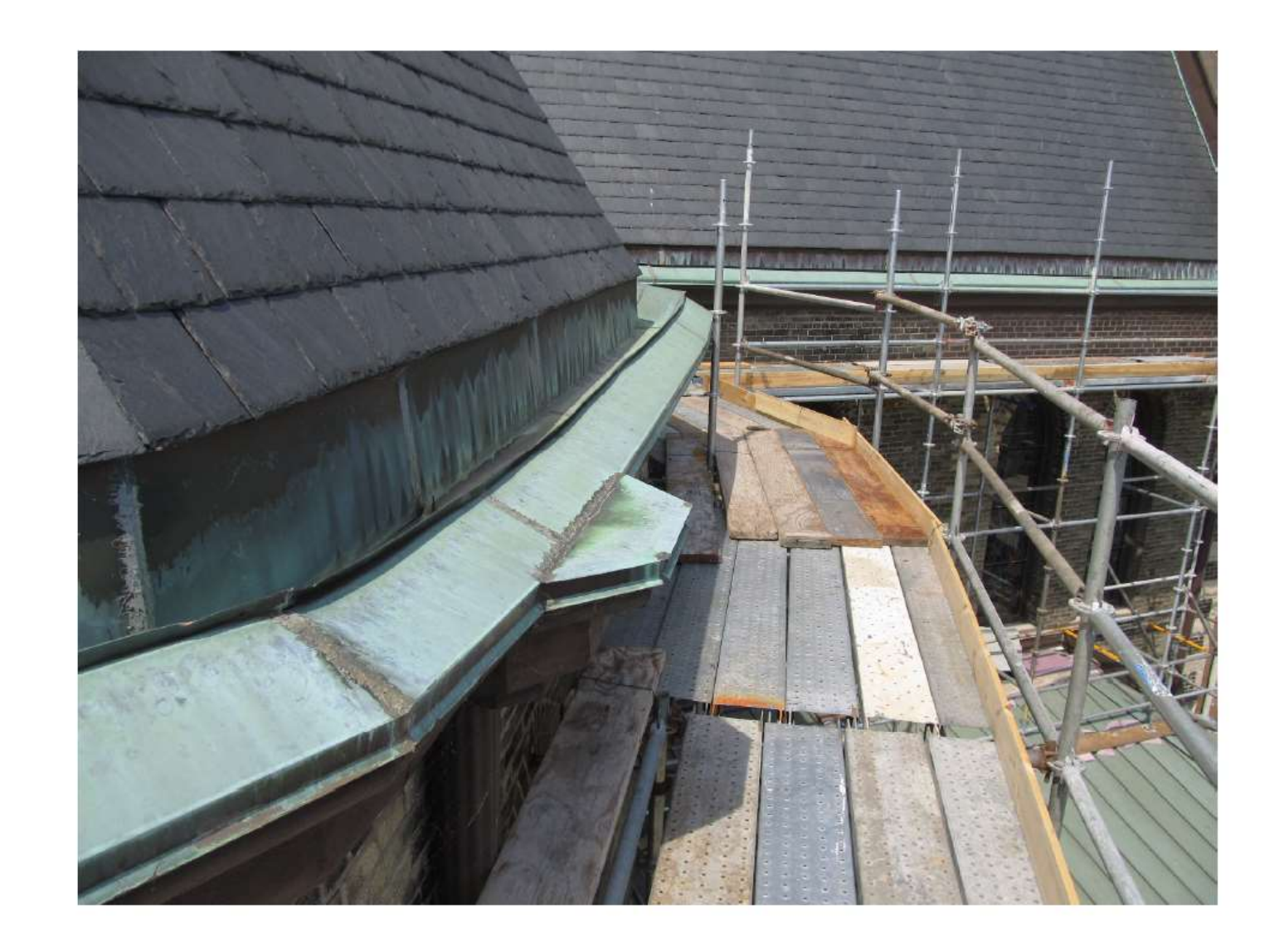
Photo 1 shows the 1972 copper gutter liner – which was leaking at holes, tears and split seams.