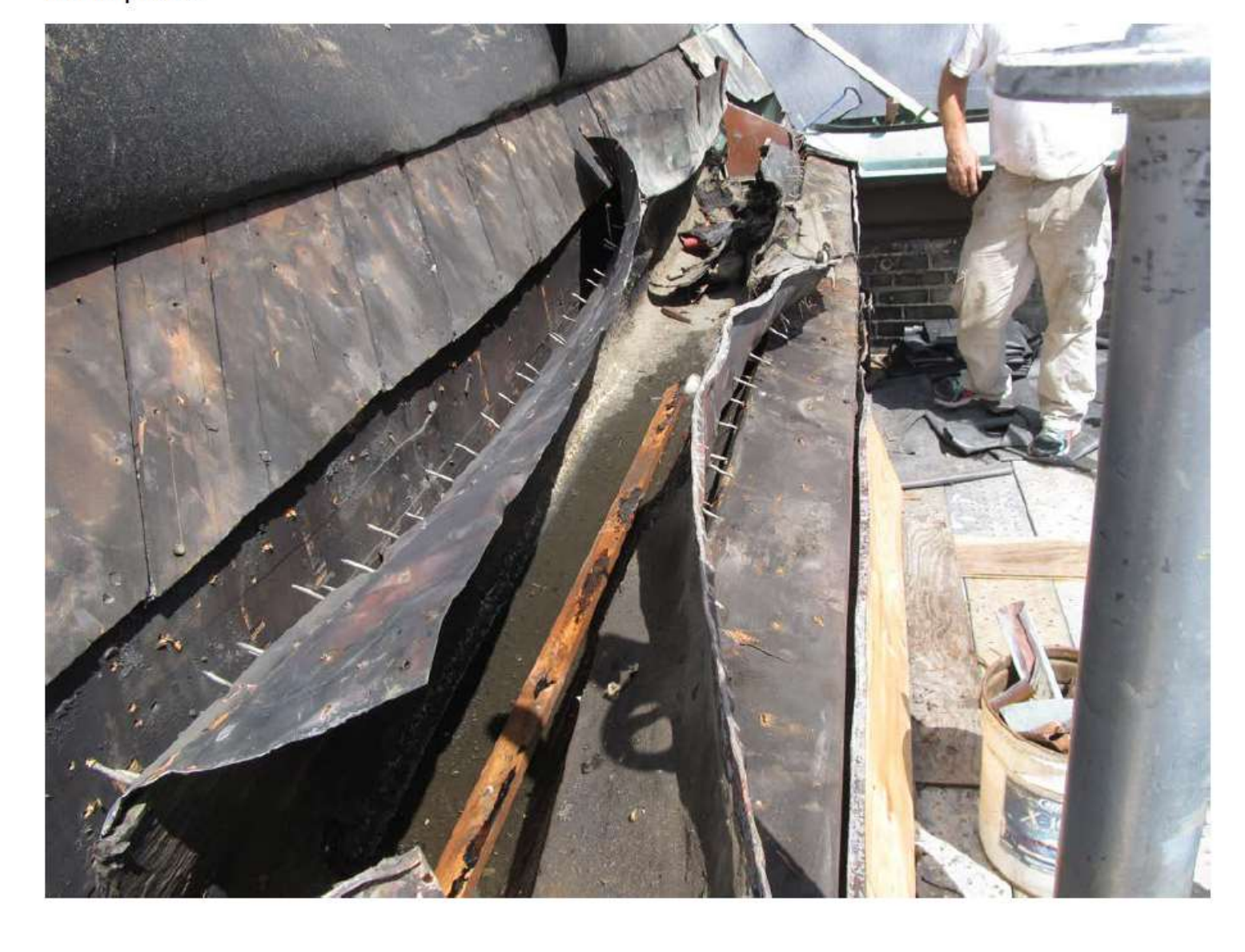
Photo 2 shows removal of the 1972 gutter liner and the later membrane liner, and then exposing the original wood gutter liner bed and top of the original cornice which were left in place.