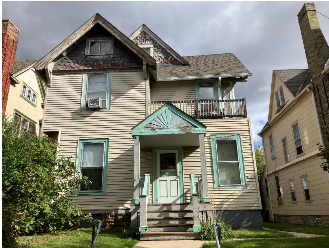
Upper porch to receive new EPDM roof and new rails/balusters