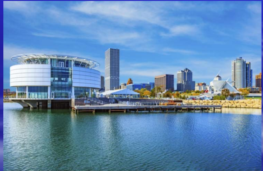
The city of Milwaukee, Wisconsin.