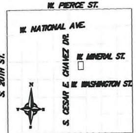
VICINITY MAP 1" = 2000' SE 1/4 31-7-22