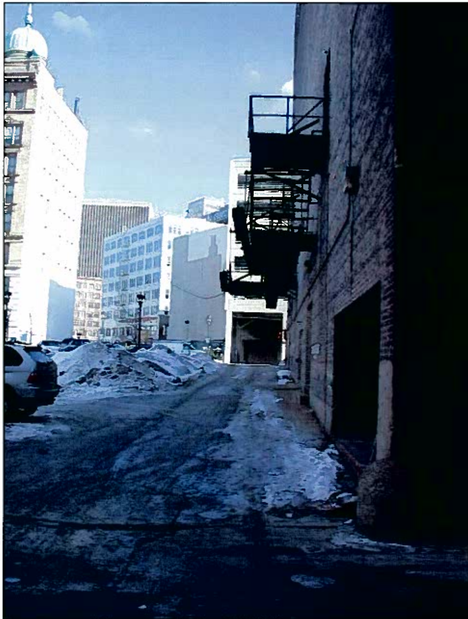
CCF 081043 212 W Wisconsin Ave 2-2-2009 Looking E towards N 2nd St at E-W alley and wheel guard, fire escape and concrete step. Alley vault/Hollow alley is also in E-W alley.