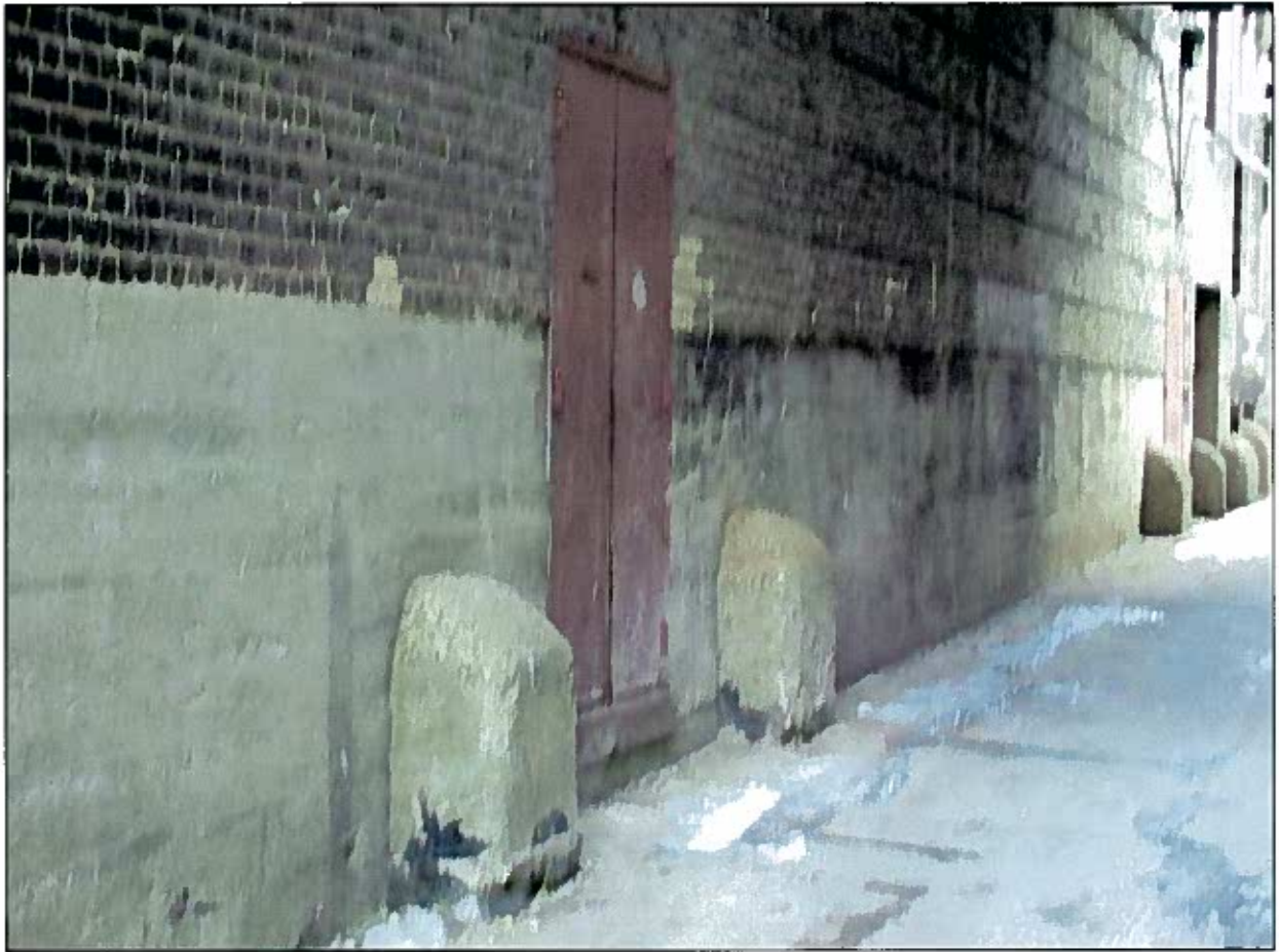
CCF 081043 212 W Wisconsin Ave 2-2-2009 Looking SE across the N-S alley at wheel guards and one set of excess door swings.