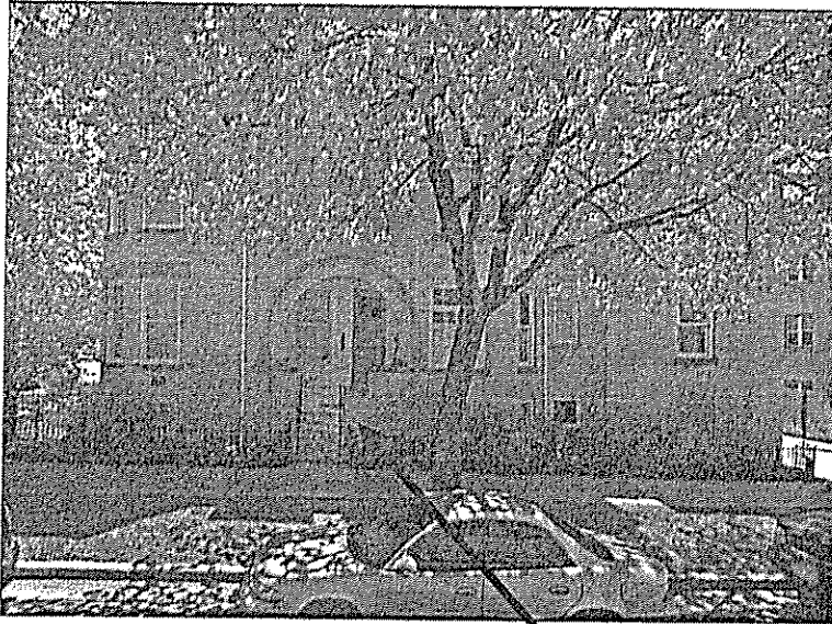
Existing North Elevation from East Pleasant Street