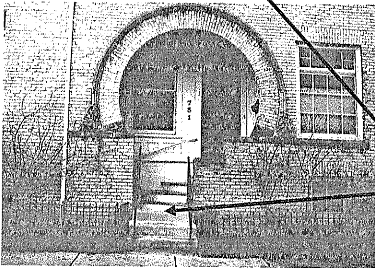
Existing Entrance Stair Elevation

Steps at 731 E. pleasant street to be removed and replaced in kind with new concrete at the bottom and new wood at the top.