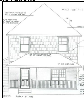
725 South 21st Street

Total construction costs for each home will be approximately $170,000. After completion, the homes will be sold to owner-occupants with income below 80% of the County Median income