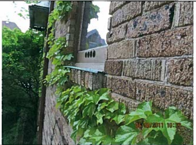
Same snow guards installed elsewhere