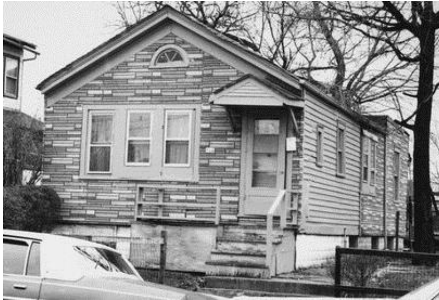
110 W. Brown in 1982