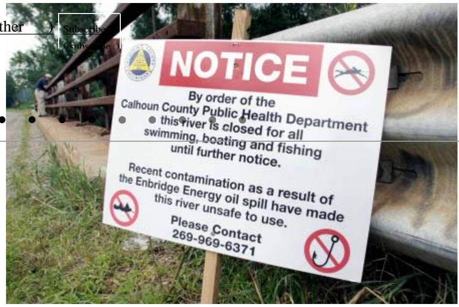
A sign is posted on a bridge to indicate water contamination after an oil spill of approximately 800,000 gallons of crude in the Kalamazoo River July 28, 2010 in Marshall, Michigan.