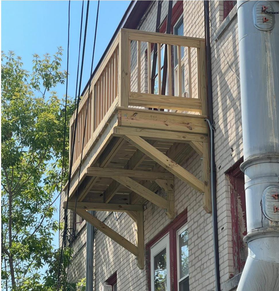
Porch as constructed