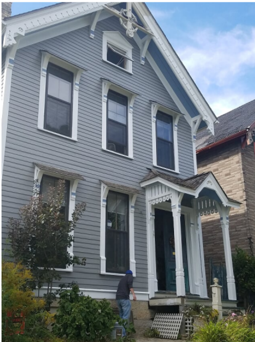
Existing Gable Ornament and Detail of Bargeboard, Trim, and Porch