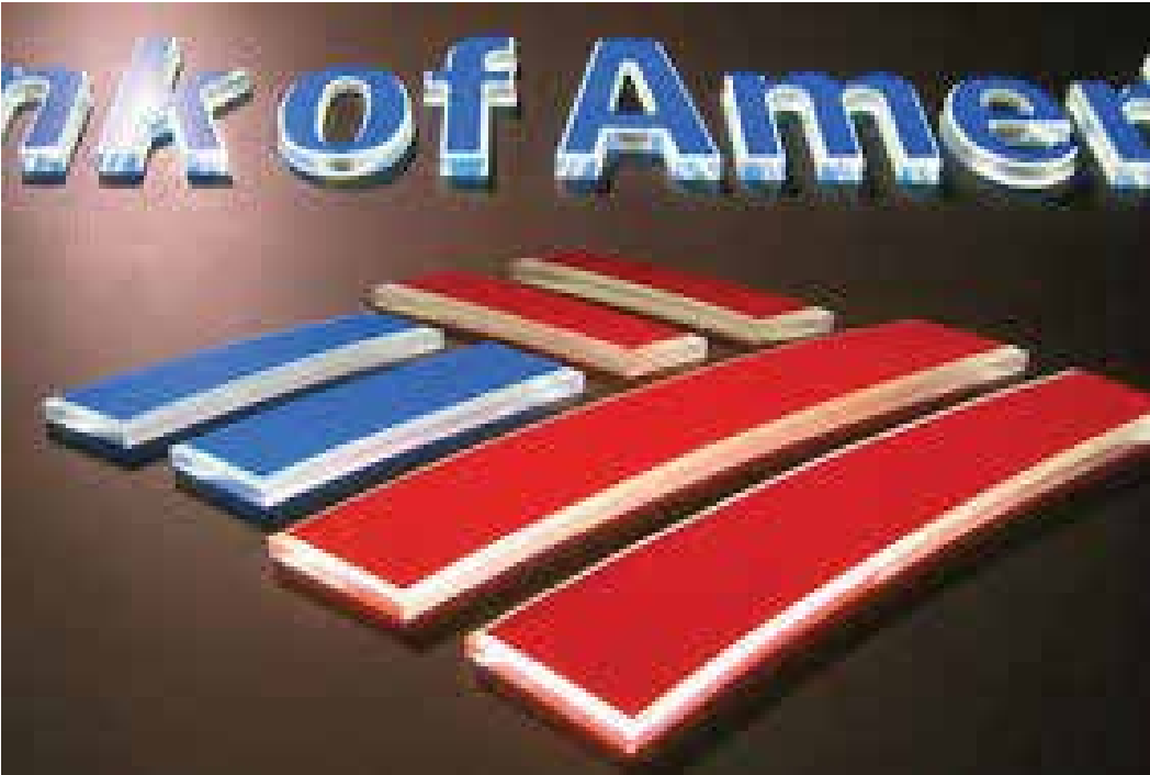
Examples of Acrylic Push Through