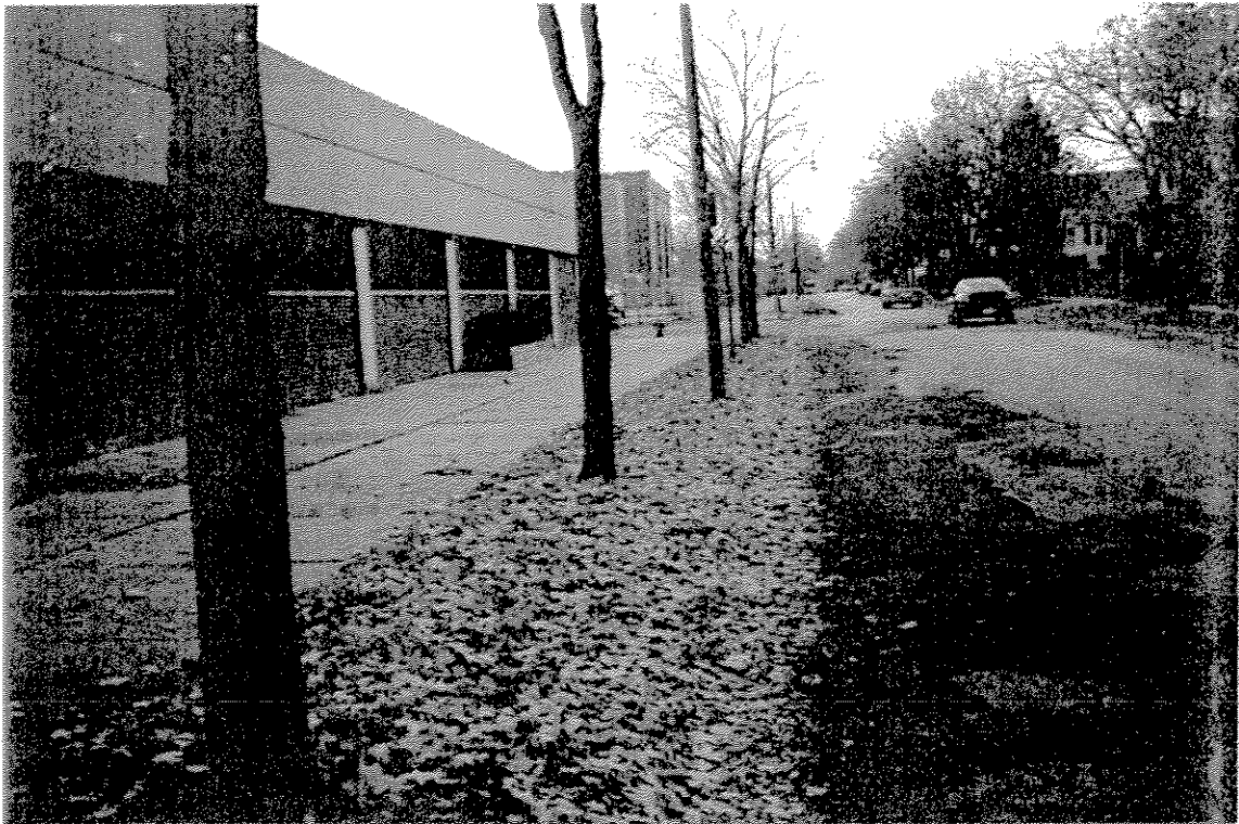
Street - N. 5th - west of St. Joseph Hospital