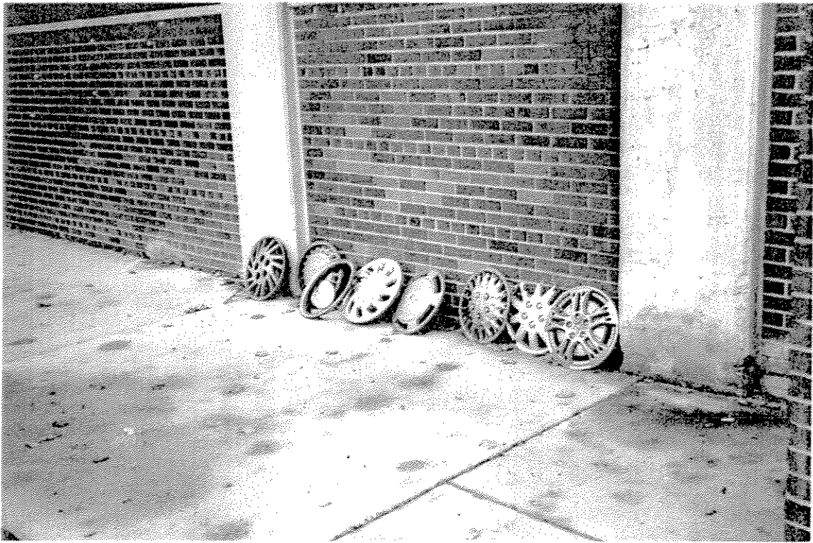
71 5th and St. - St. Joseph's Parking Structure