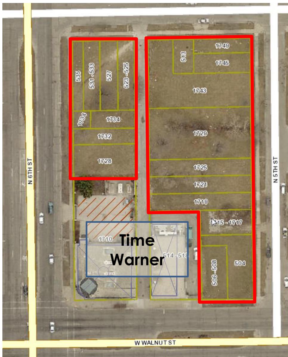
RACM-Owned Vacant Lots

RACM prepared environmental evaluation reports for select parcels and contracted with an environmental consultant to conduct Phase II Environmental Site Assessments on select parcels located within the project boundaries. RACM shall not conduct any additional environmental assessment on the Properties.