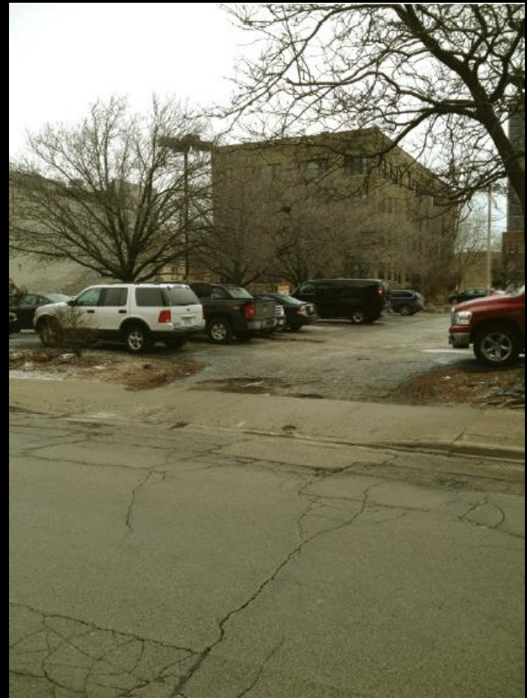
Facing northeast on N. Van Buren St.