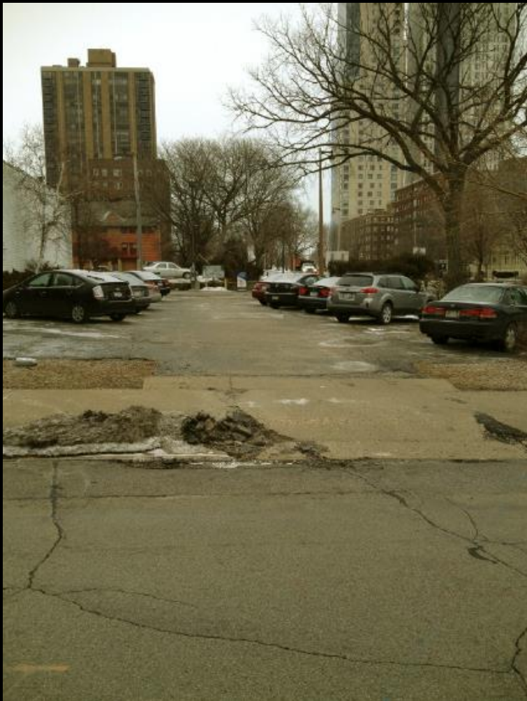
Facing east on the corner of N. Van Buren St. and E. Kilbourn Ave.