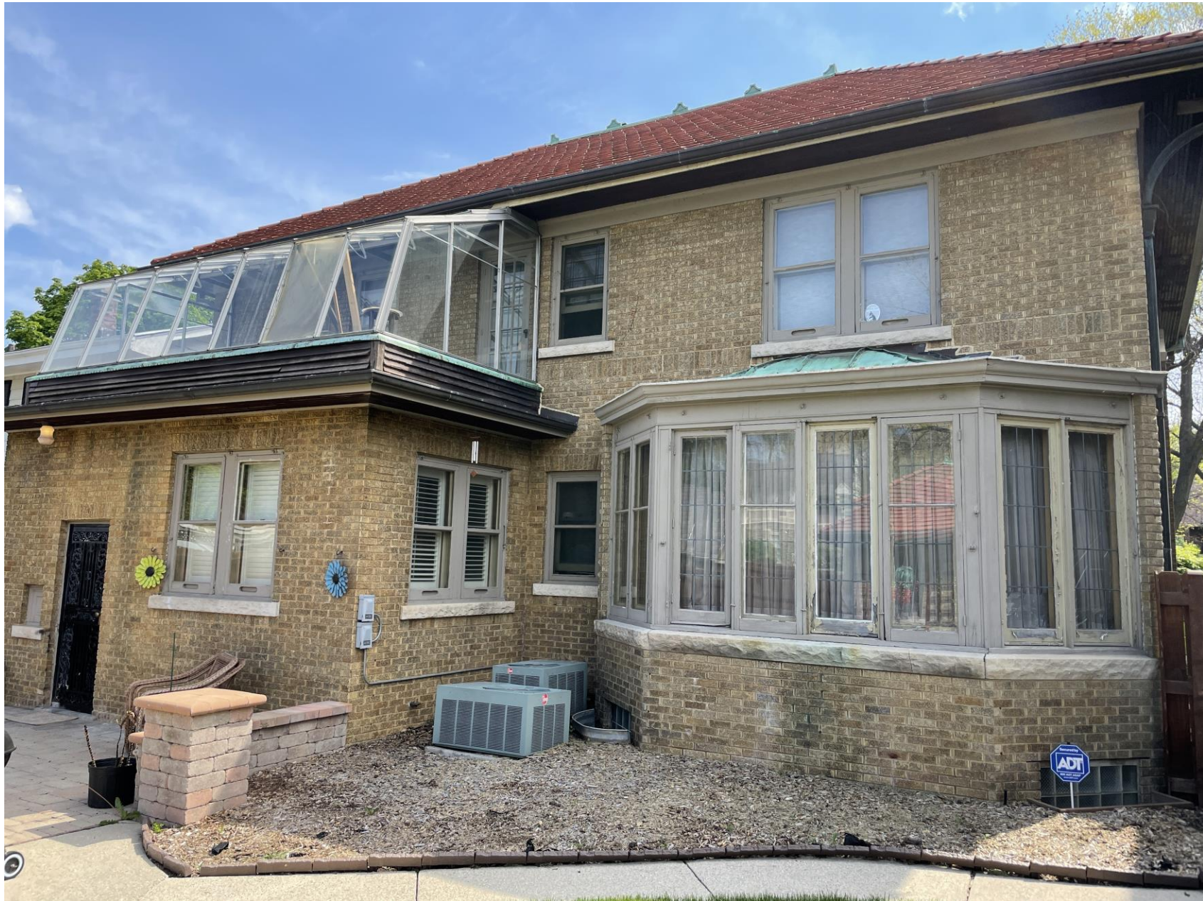
Existing sunroom at top left