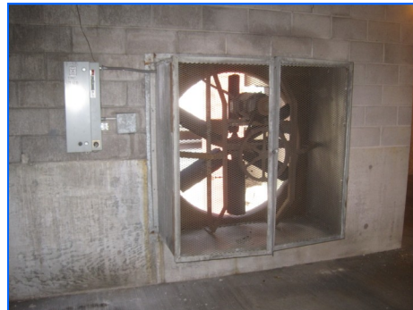
Typical exhaust fans