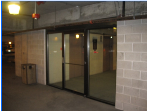
Glass and metal door