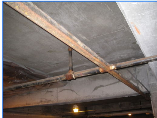
Typical condition of sprinkler pipes