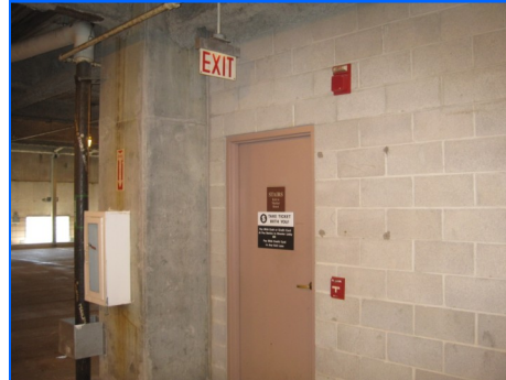
Fire warning system detection devices