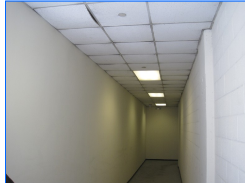
Typical hallway finishes