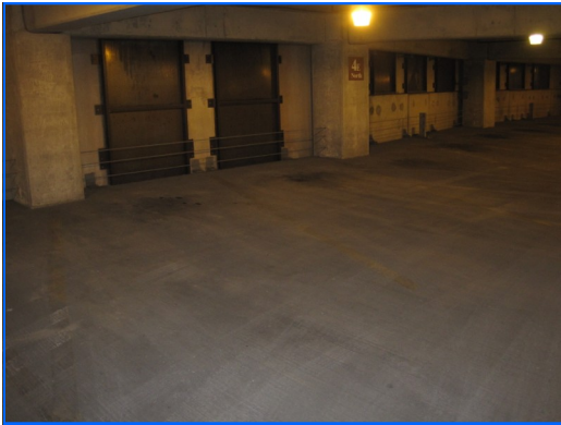
Worn pavement markings