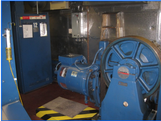
Elevator hoist and controls