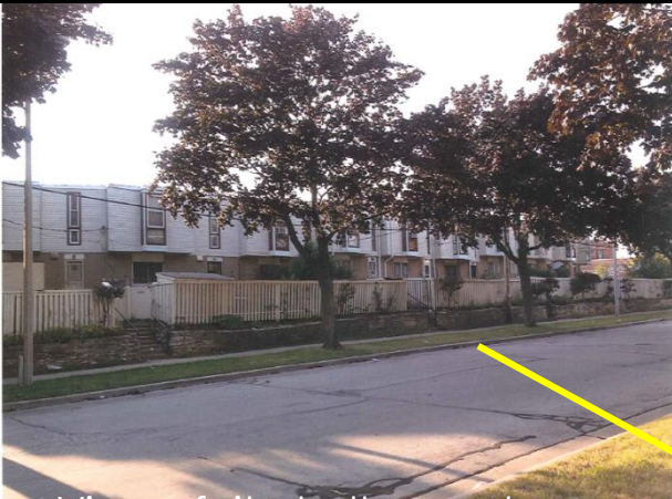
View of site to the west