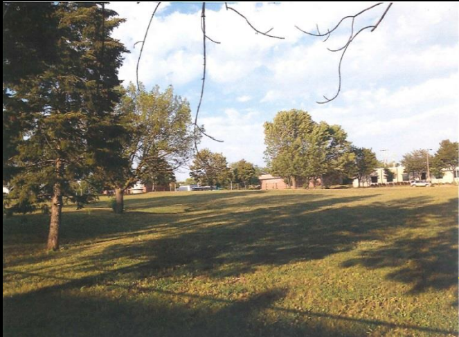
View of current site from southwest corner