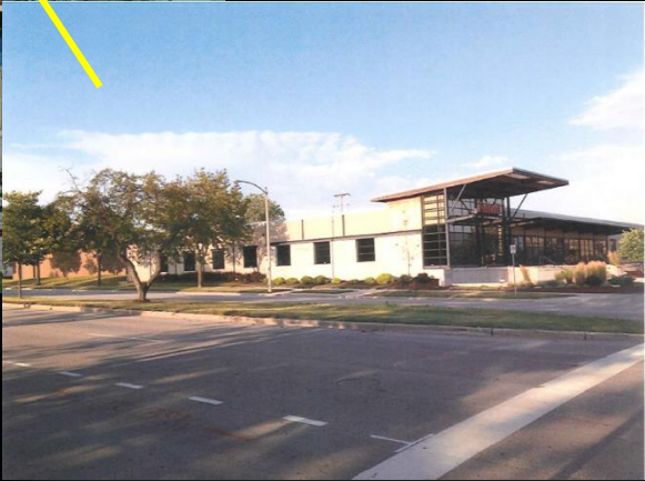
View of site to the east