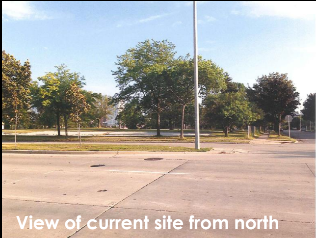
View of current site from north

File No. 131373. An ordinance relating to the change in zoning from Multi-Family Residential to a Detailed Planned Development known as the Sojourner Family Peace Center, for new construction, on land located at 619 West Walnut Street, in the block bounded by West Walnut Street, North 6 th Street, West Galena Street and North 7 th Street, in the 6 th Aldermanic District.