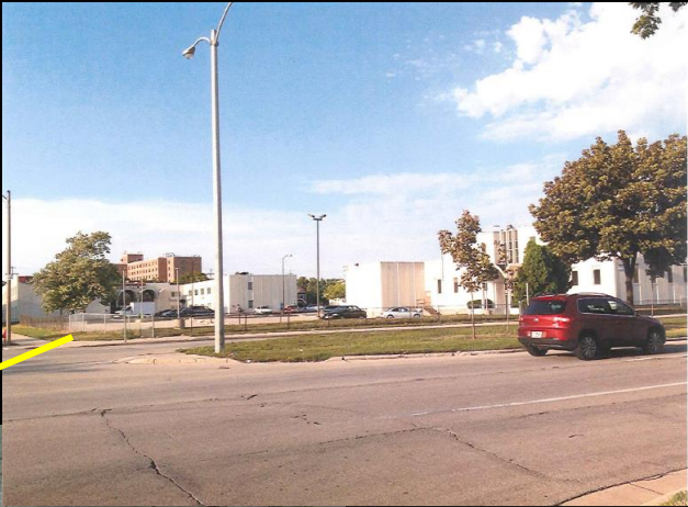
View of site to the north