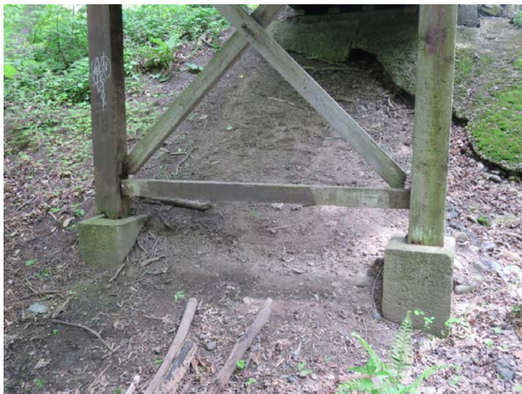
Columns/Concrete Piers.