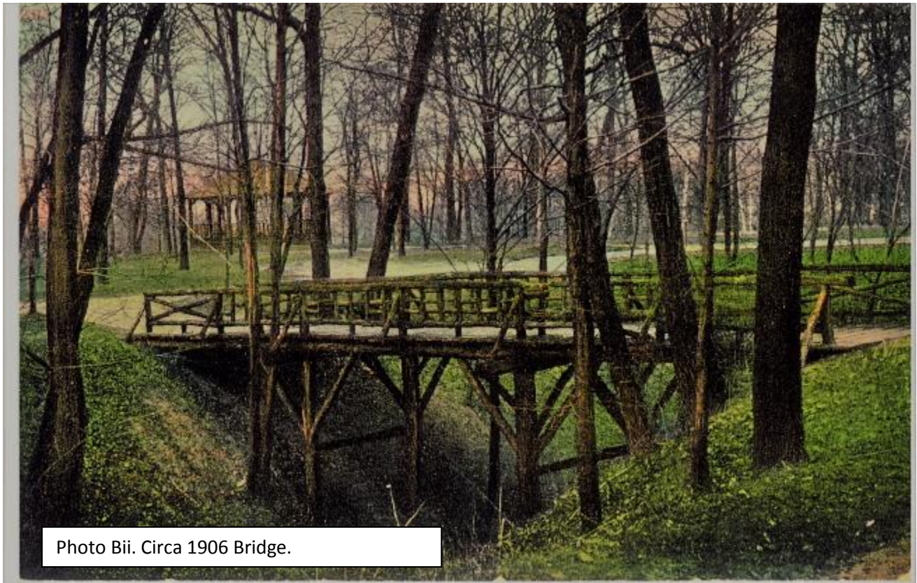
Circa 1906 Bridge.