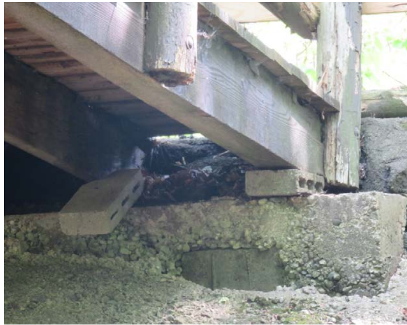
Photo D. South Concrete Foundation.