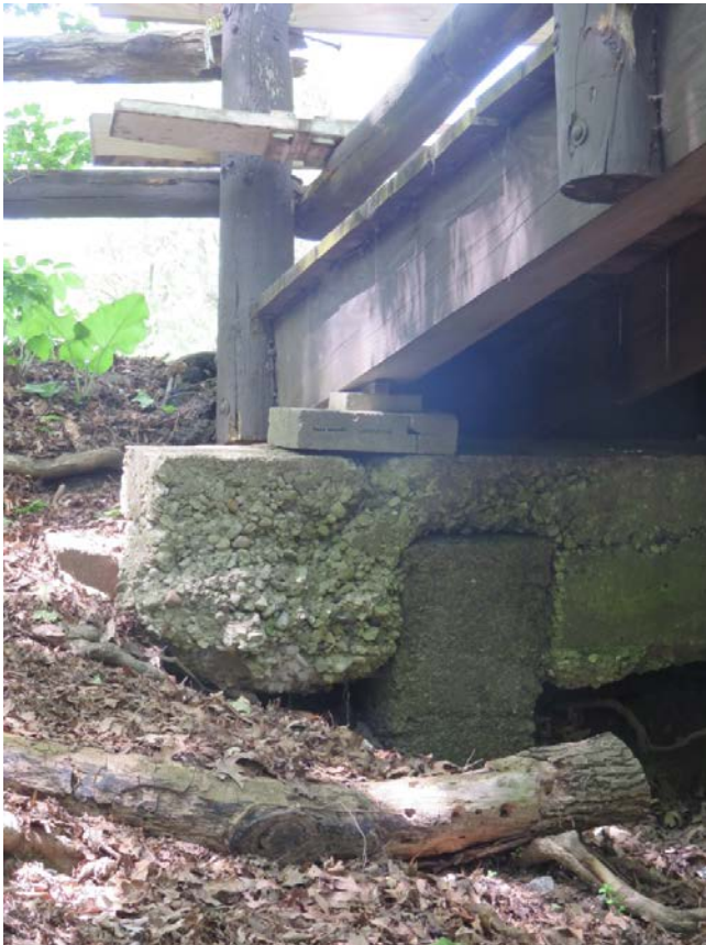
Concrete Foundation.