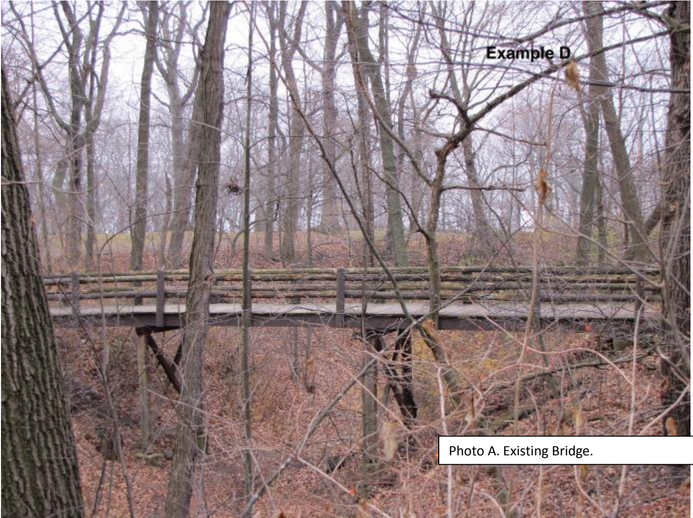
Photo A. Existing Bridge.