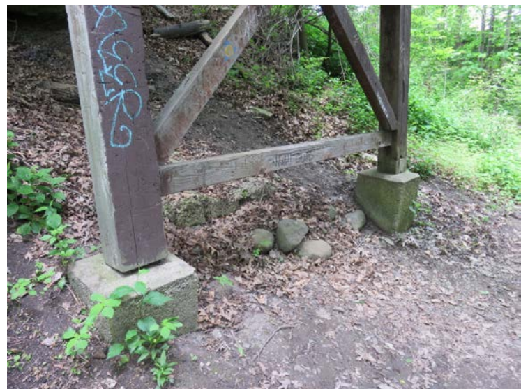
Photo F. Wood Columns/Concrete Piers.