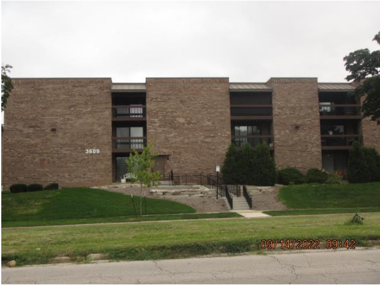
3609 N Tucker PL Unit 210