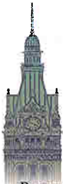
Tom Barrett Mayor, City of Milwaukee