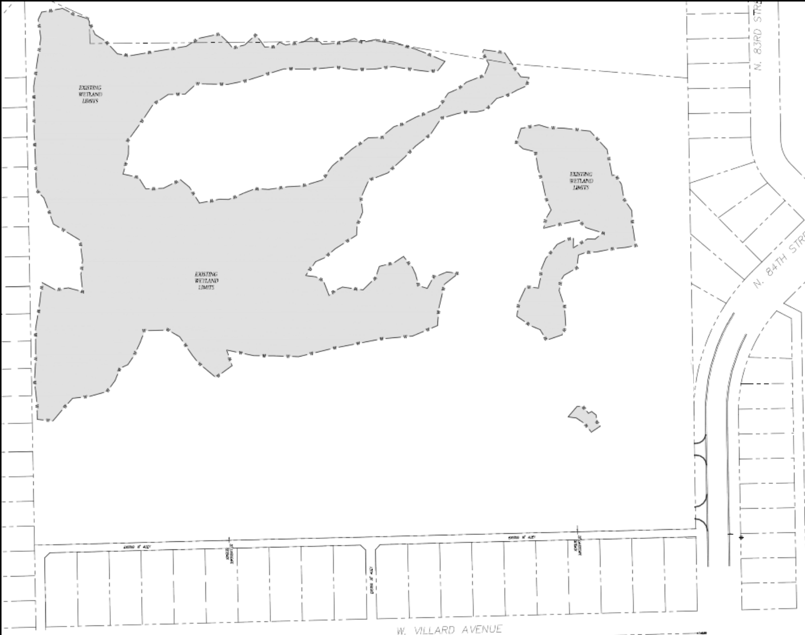
File No. 140867. Site with Wetlands.