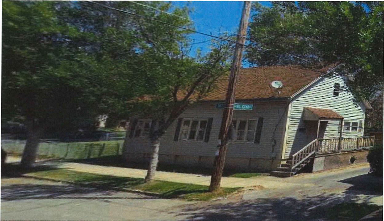
Front entrance off of alley