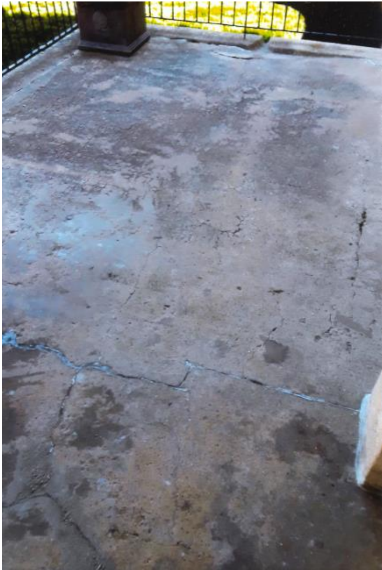
Porch surface to be resurfaced with concrete