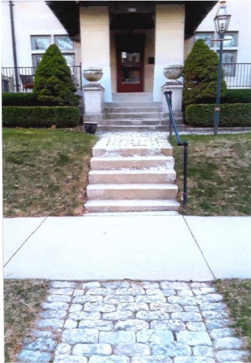
Stone pavers to be replaced with concrete