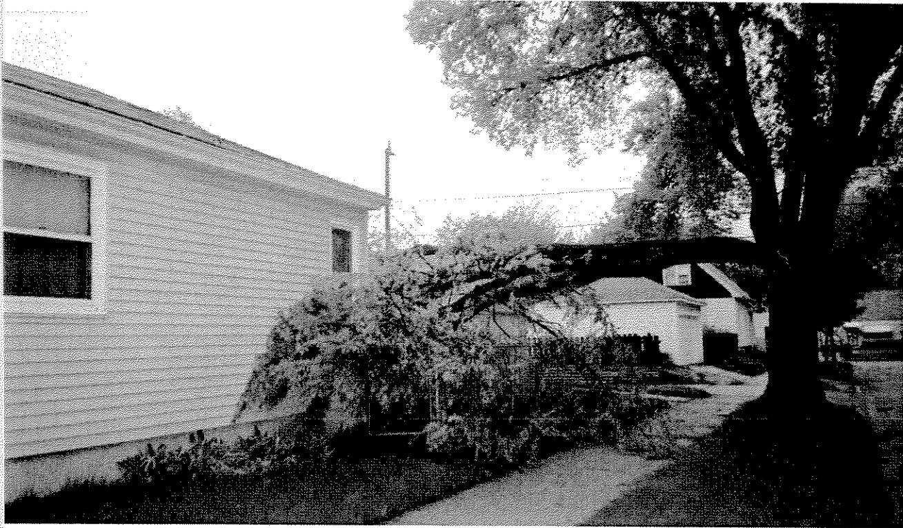
Sidewalk part of tree has been removed off house