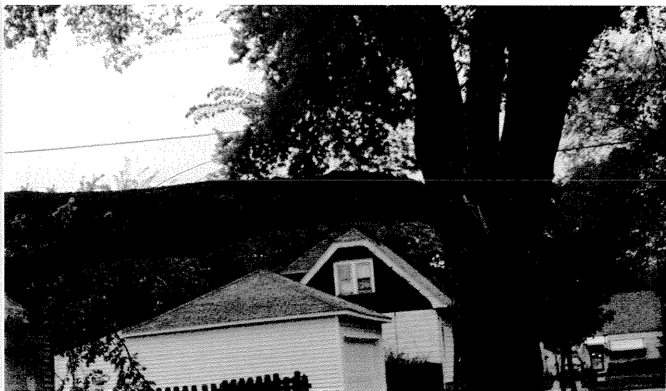
Sidewalk tree branch is down