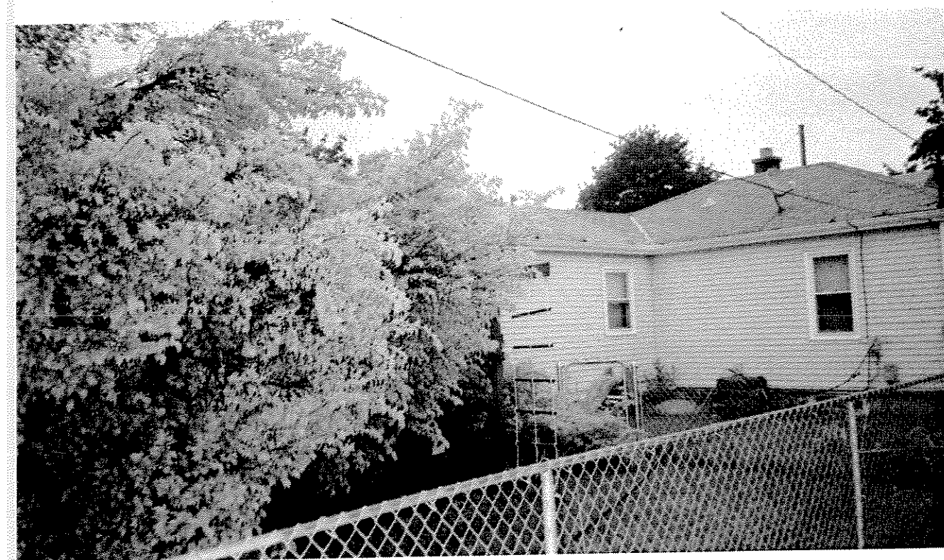
#2 Back of House Tree covered swingset and bedroom