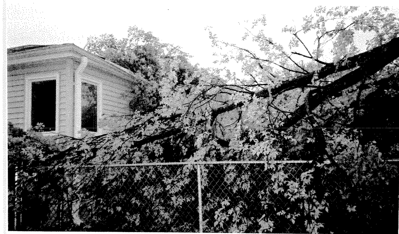
Tree on sidewalk cover fence, side of bedroom and playground area.