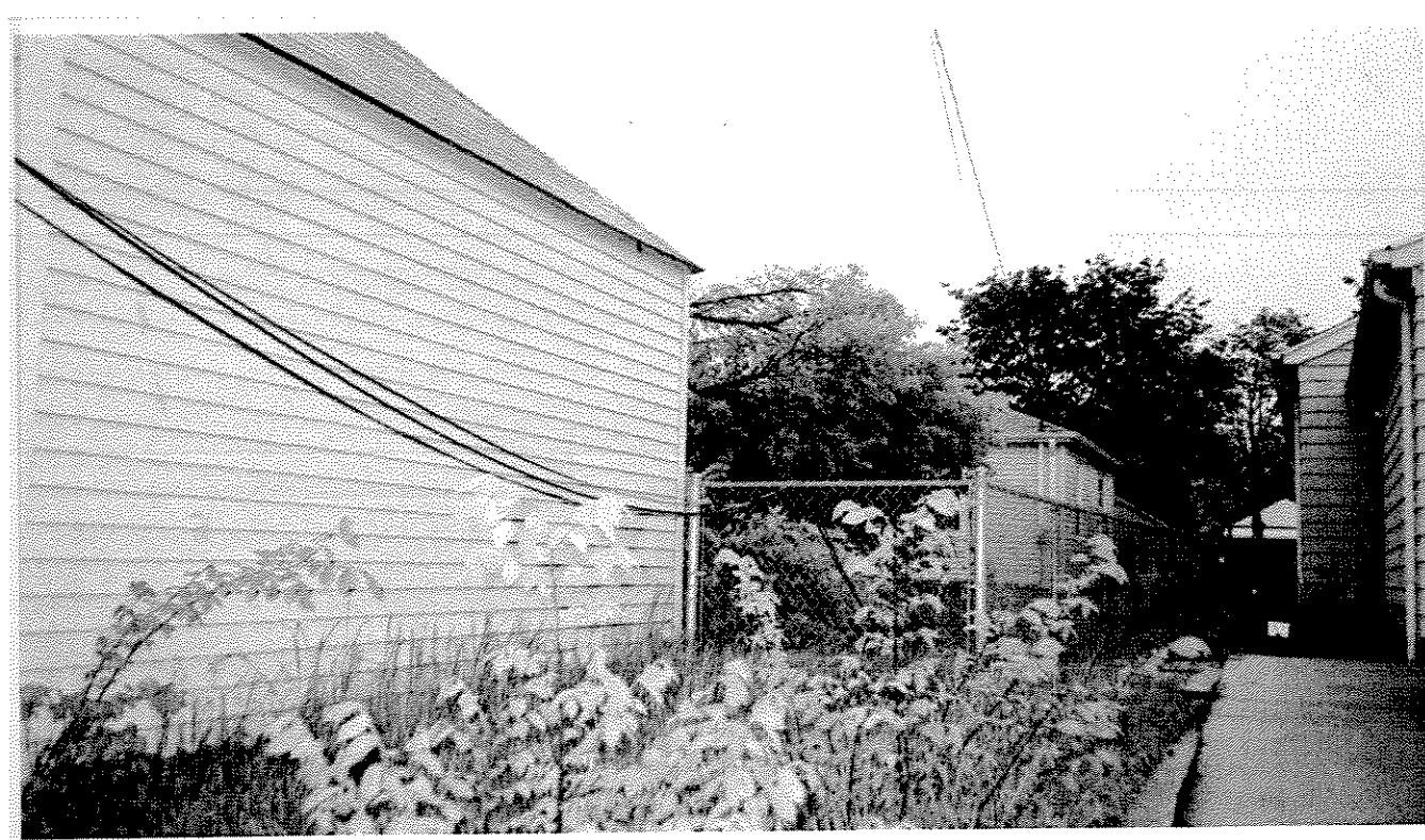
Alleyway of garage tree on wires and covering playground area and bedroom