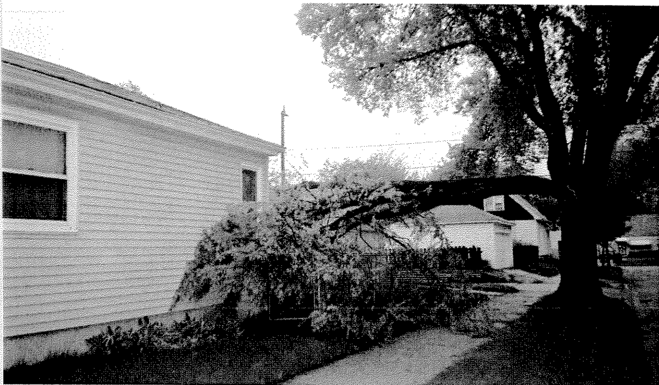
Sidewalk part of tree has been removed off house