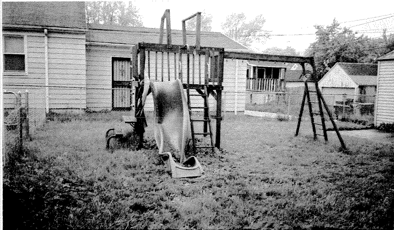
after tree was removed damage to the wooded playset and fence