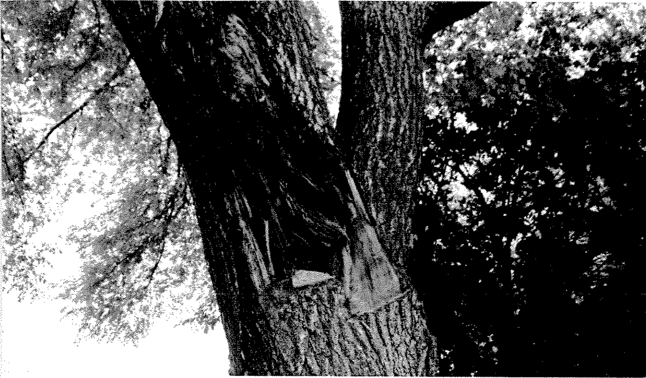
You can see lightening strike tree a long time ago. Tree was weak and hollow