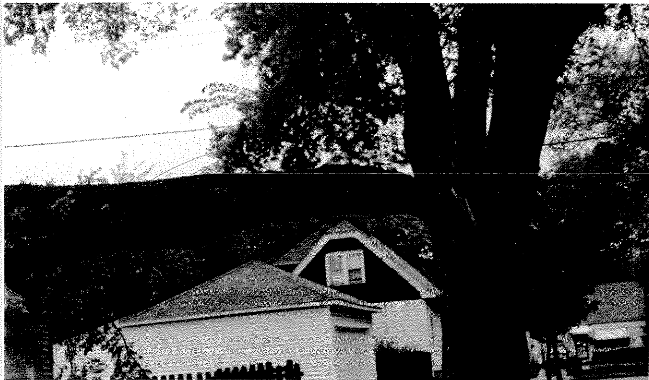
Sidewalk tree branch is down