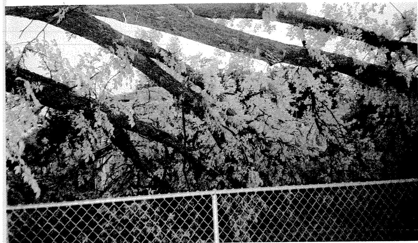
#1 Sidewalk House + playground Tree covered House and Swingset