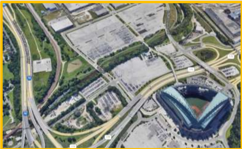
Aerial view looking southeast