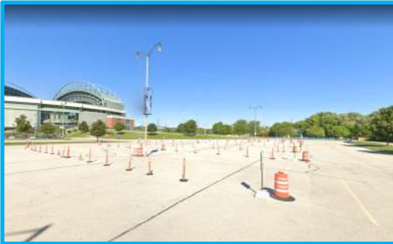
View from south end of the site looking northwest