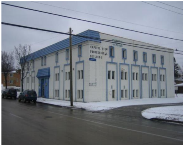
City commercial property southeast view

3953 North 76th Street (the "Property") consists of a multi-story brick office building constructed in 1970, having 21,000 square-foot of space on a 19,200 square-foot parcel with approximately 30 surface parking spaces. The Property was previously occupied as a multi-tenant office building and is located in close proximity to West Capitol Drive Commercial Corridor. The Property is zoned LB1 or Local Business and located within the Nash Park Neighborhood and was acquired through property tax foreclosure on November 14, 2011.