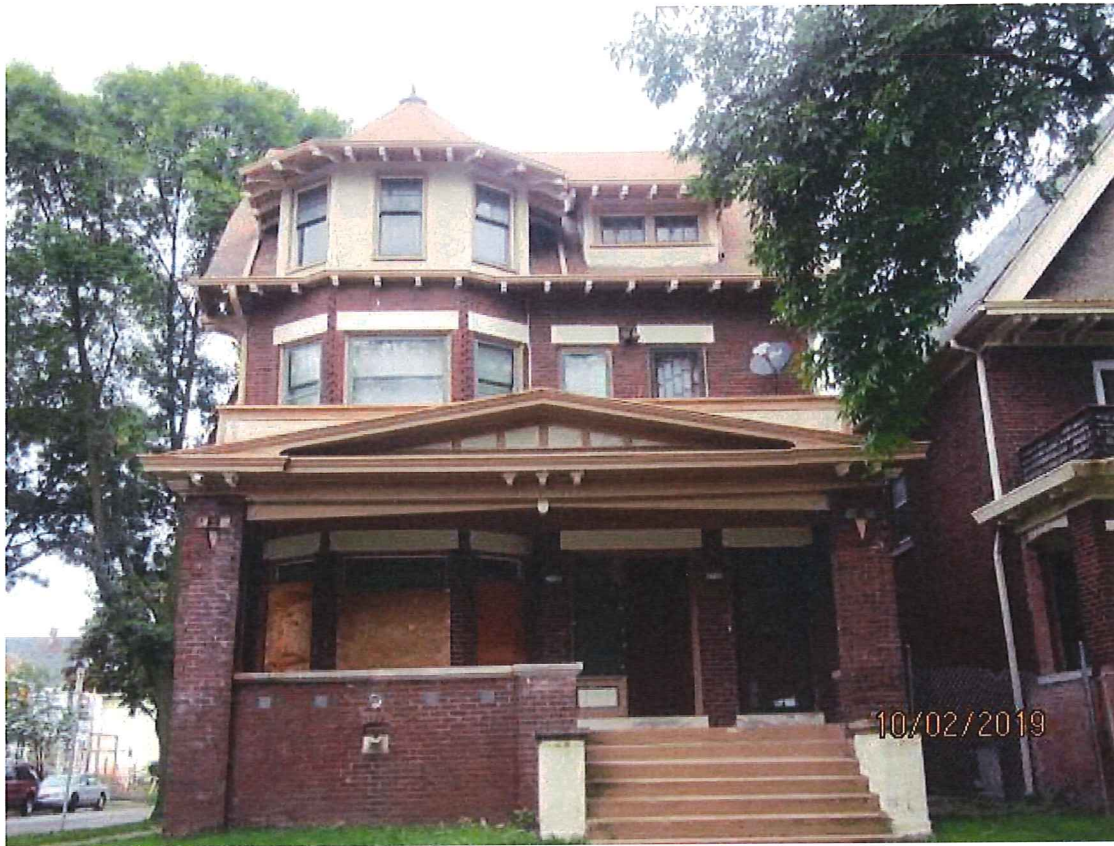
2730-32 W Garfield