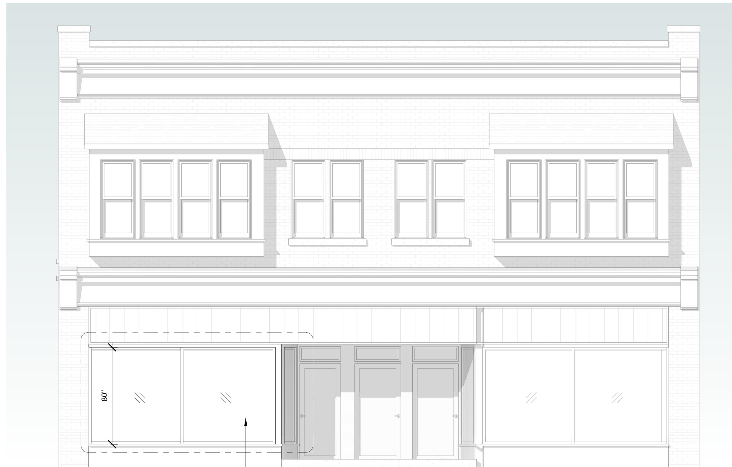
2 North Elevation 1/4" = 1'-0"

OWNER: Johnnie Piette PROJECT NO: 20.045 PROJECT NAME: Prime Cigar Co. CONTACT ADDRESS: