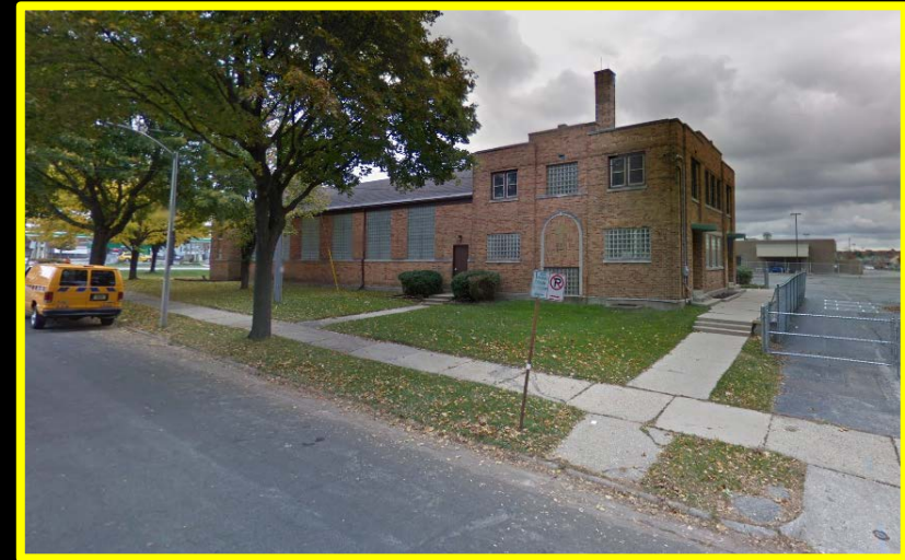
View southeast from W. Euclid Ave.