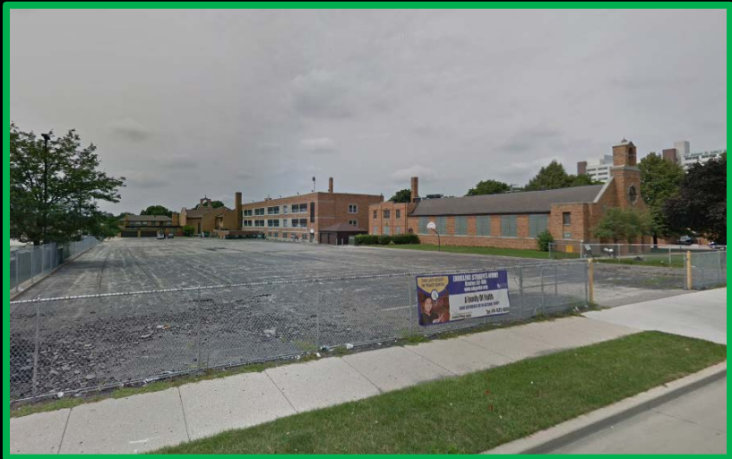
View northwest from S. 27 th St.