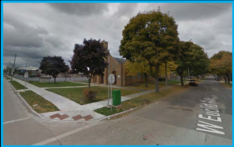
View south west from Euclid Ave and S. 27 th St.