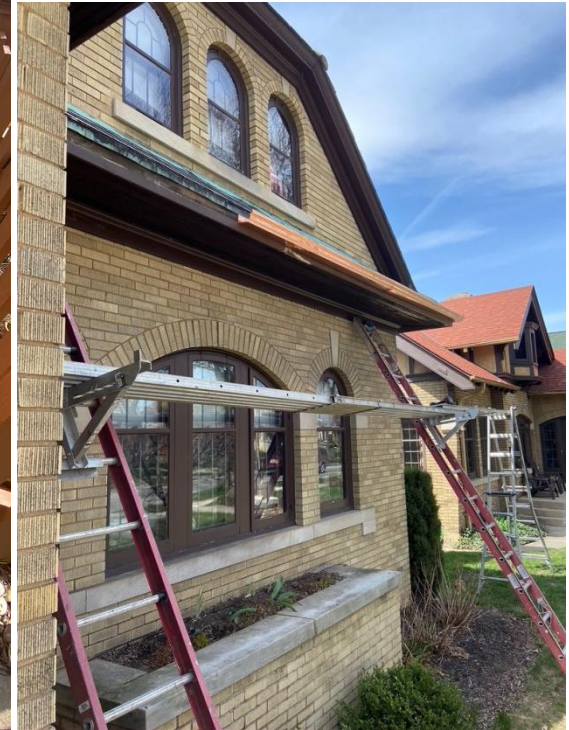
New gutters being installed and sample repaired soffit.