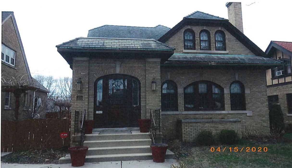
Front of house with work in progress.