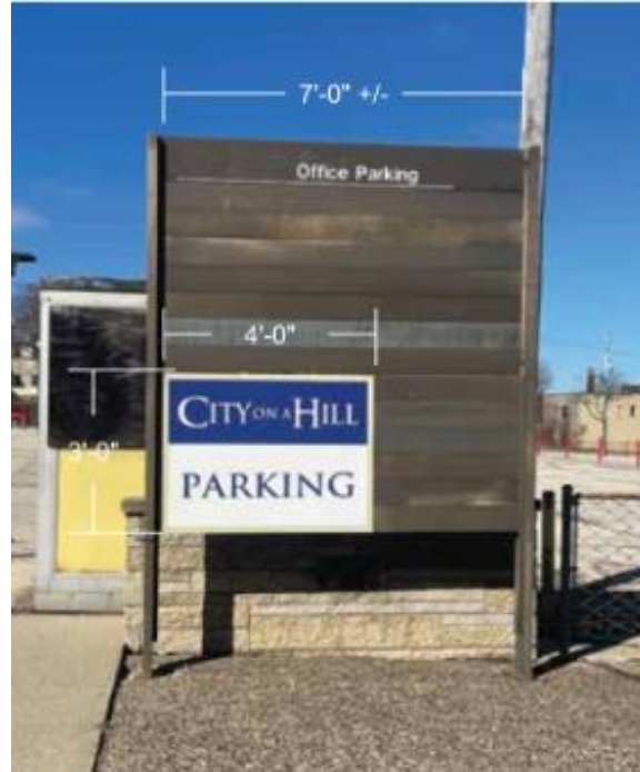
Proposed Location of Monument Sign (corner of N. 23 rd St. & W. State St.)