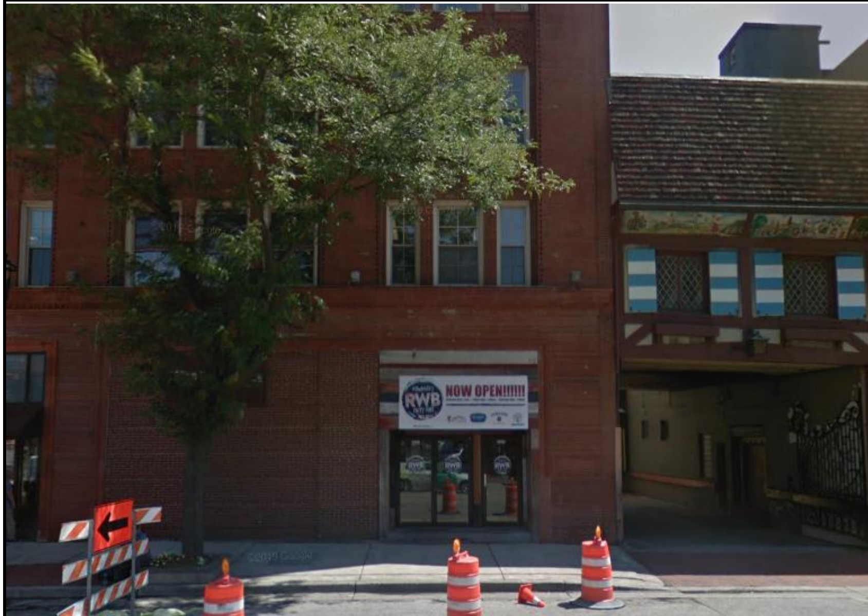
Street view of the property ca. Aug. 2018