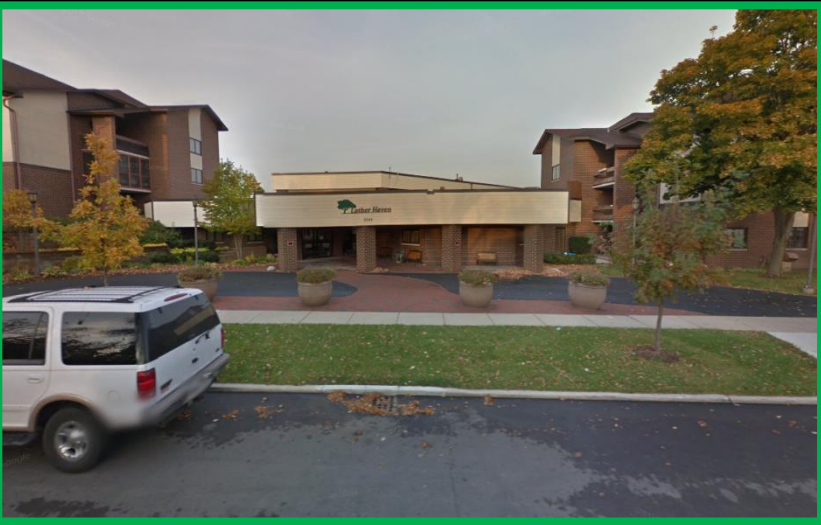
View from North 97th looking west