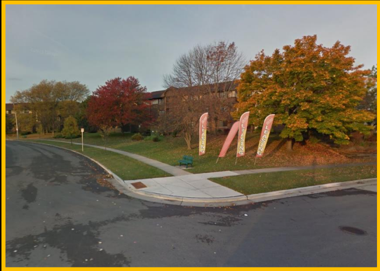
View from North 97th and North Michele Street