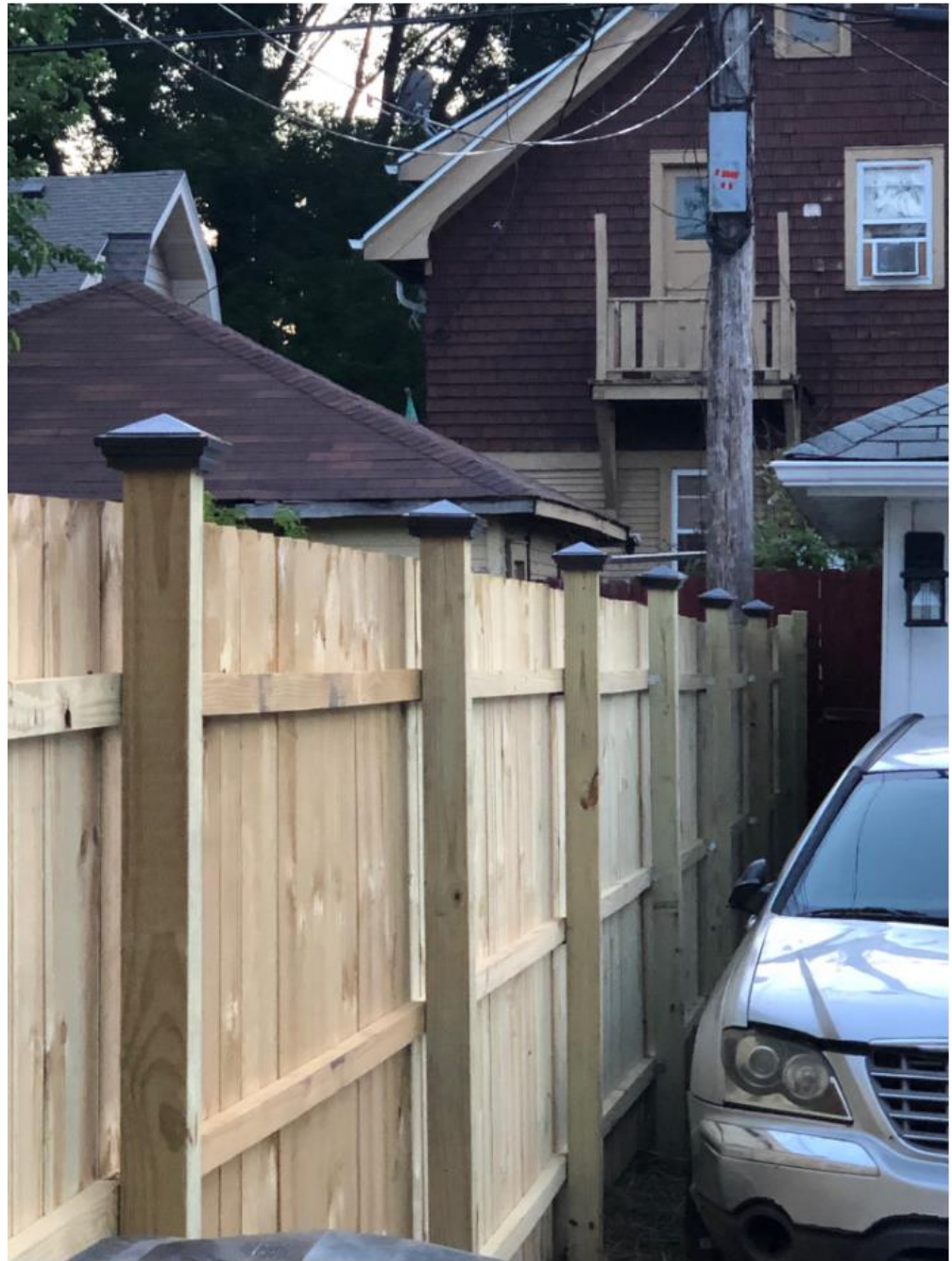
Photograph of fence installed