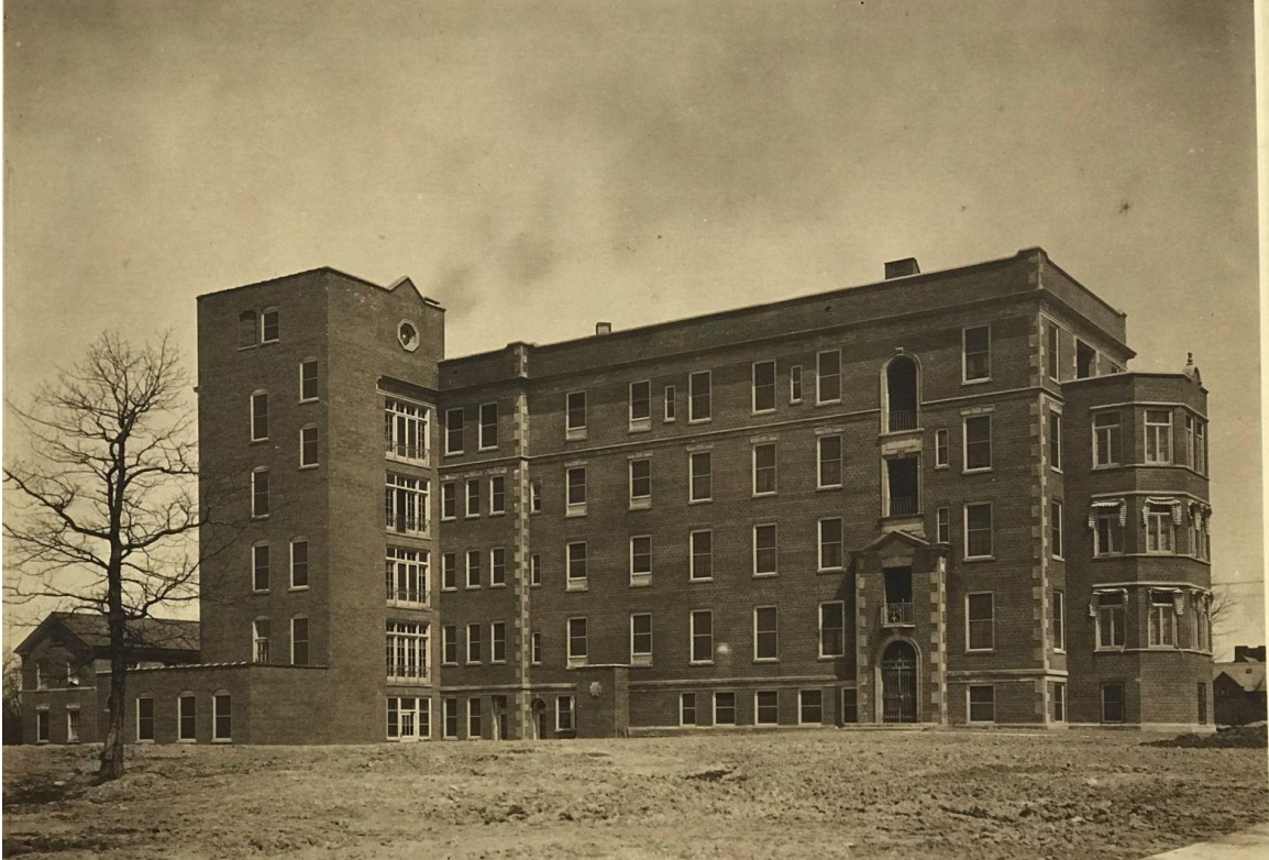
West Side of original wing