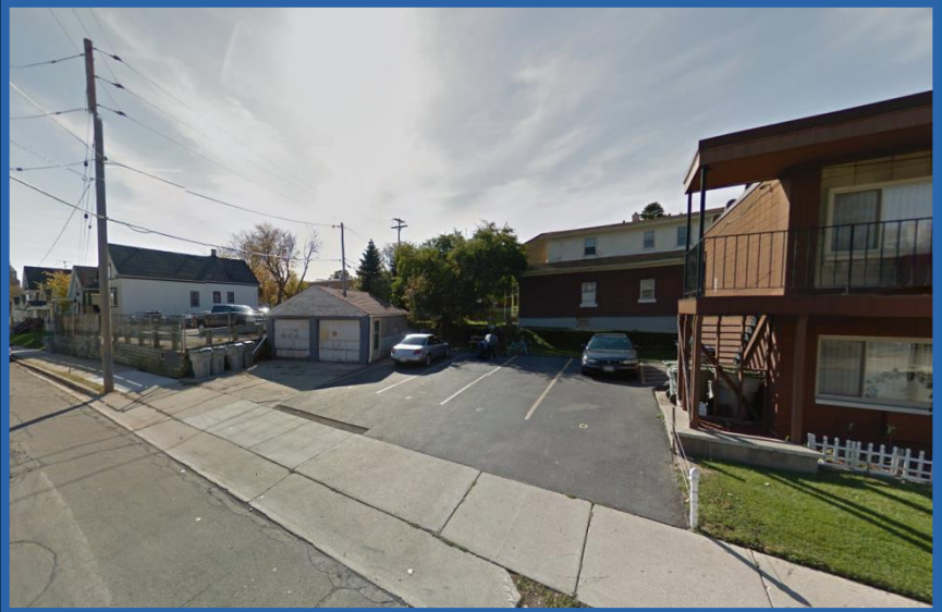
View from West Vilter Lane, looking southeast