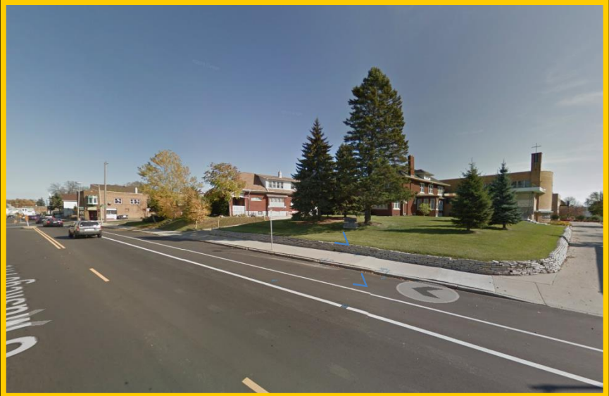
View from South Muskego Avenue, looking northeast