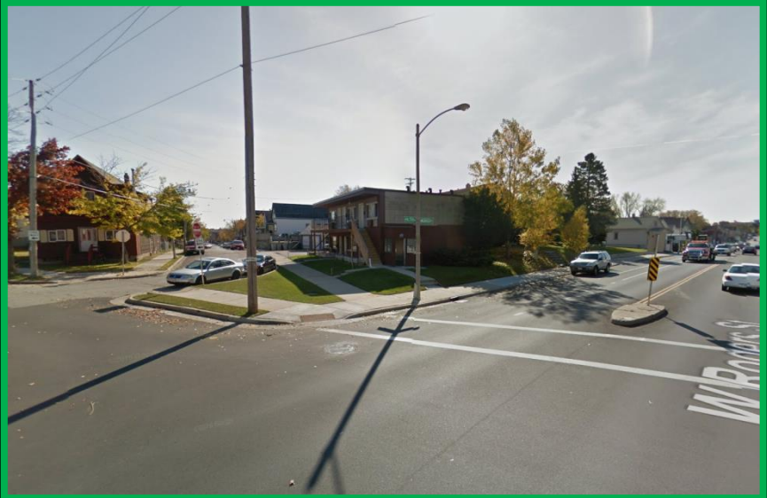
View from South Muskego Avenue and West Rogers Street