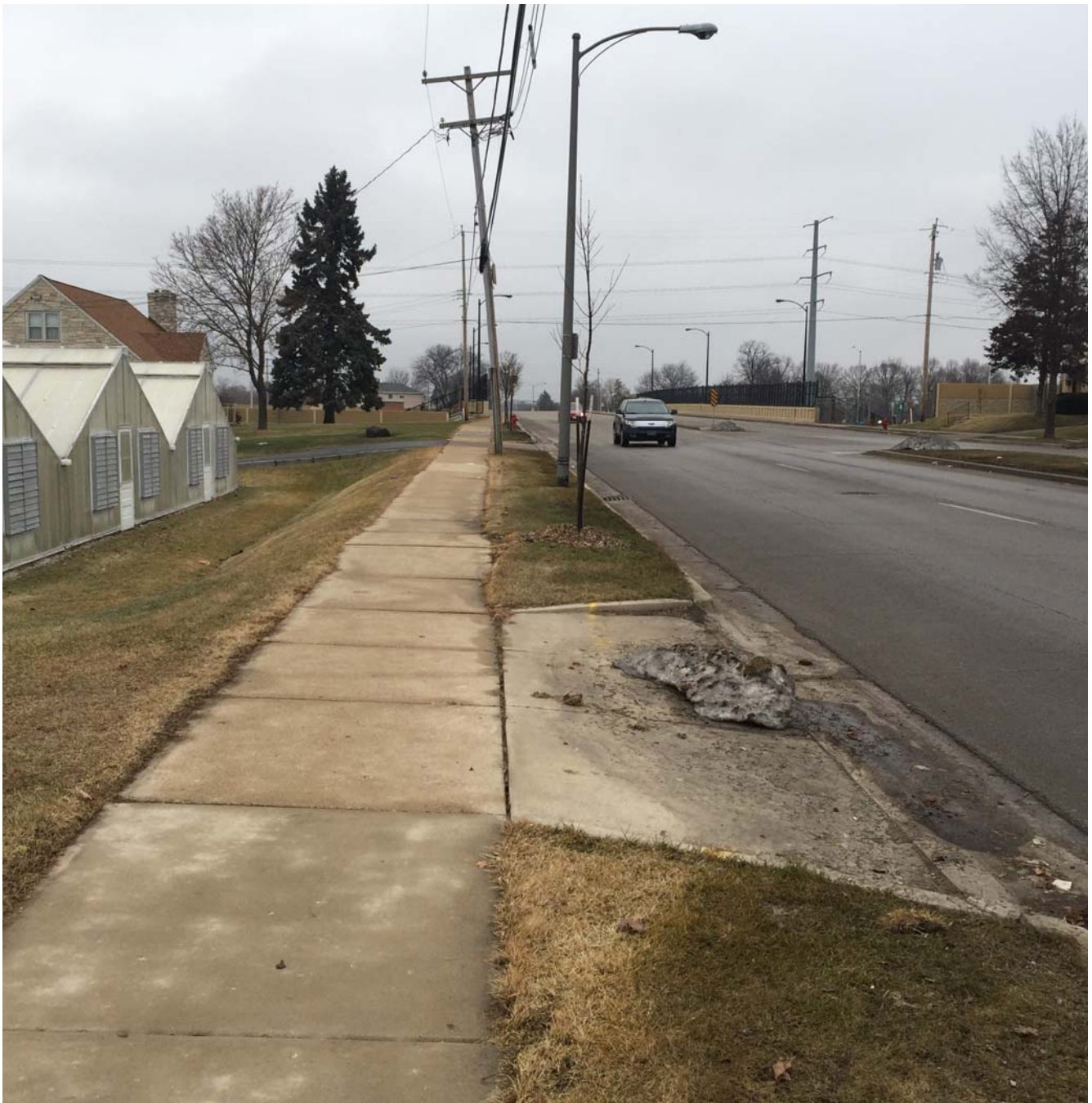
Photo 2 - The east portion of property from the southeast property corner, looking north.