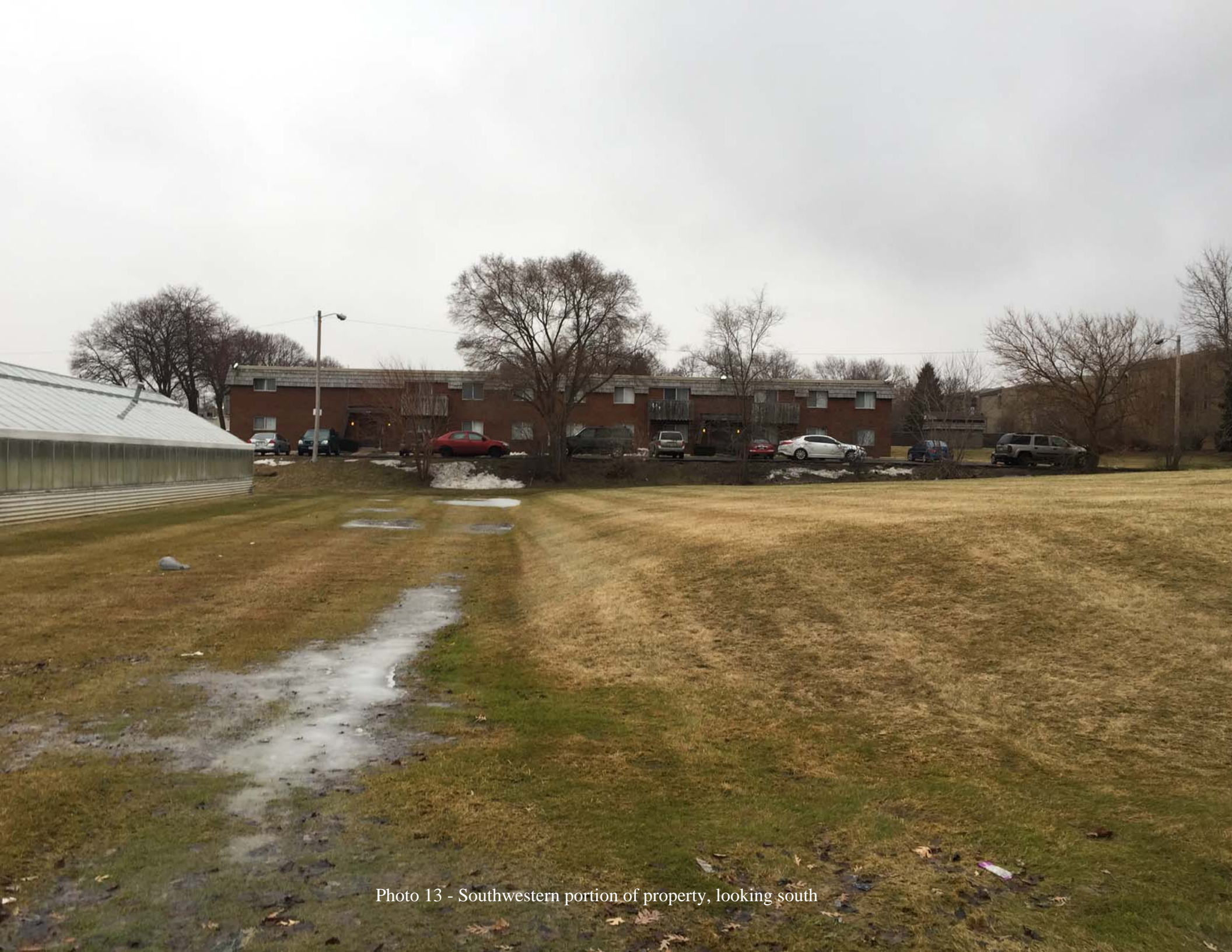
Photo 13 - Southwestern portion of property, looking south