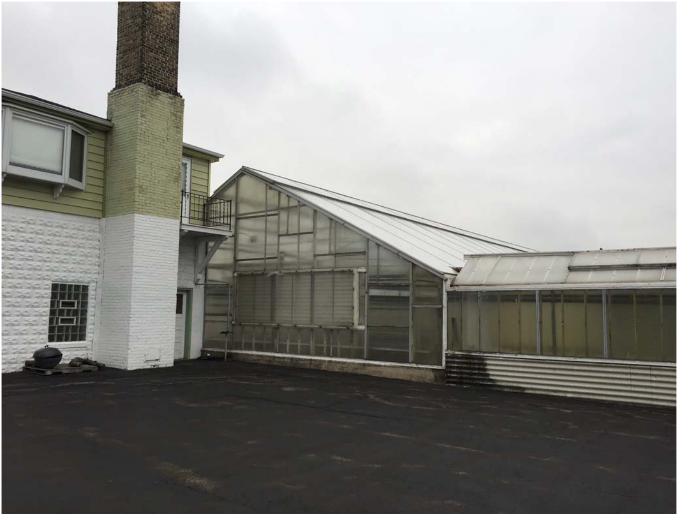
Photo 7 - The northern portion of the existing greenhouse from the center of drive, looking south.