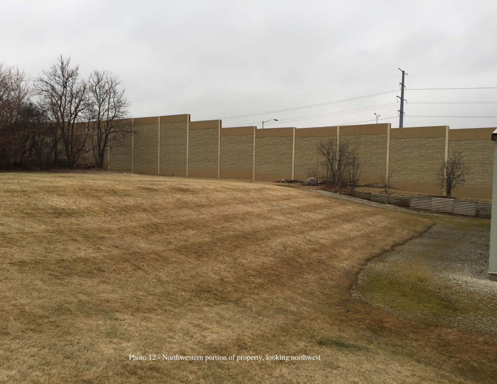
Photo 12 - Northwestern portion of property, looking northwest