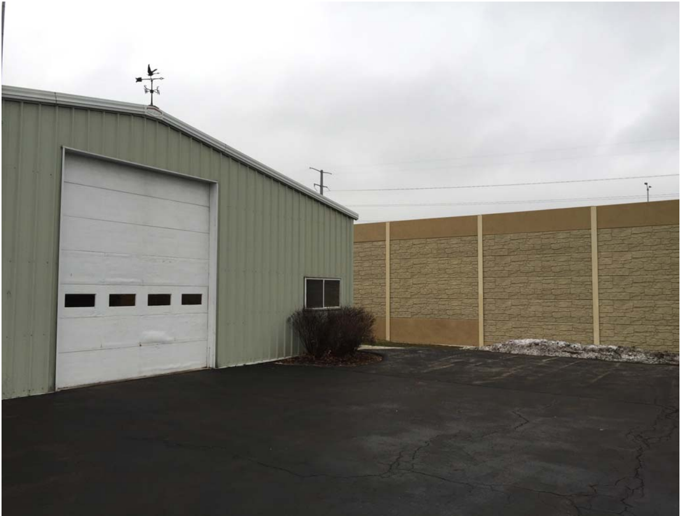
Photo 8 - The eastern portion of the existing garage from the center of drive, looking northwest.