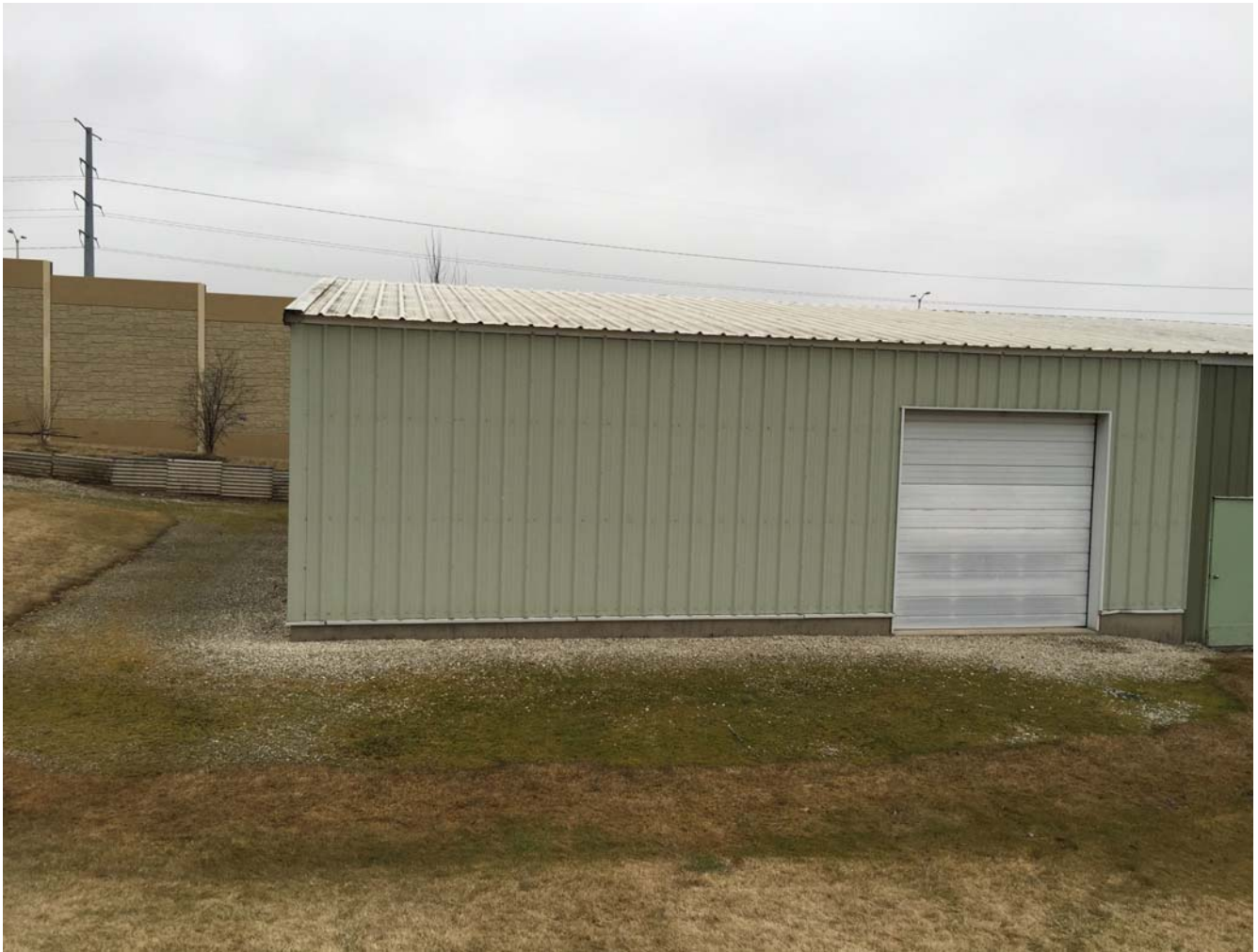
Photo 11 - The southern portion of the existing garage, looking north.