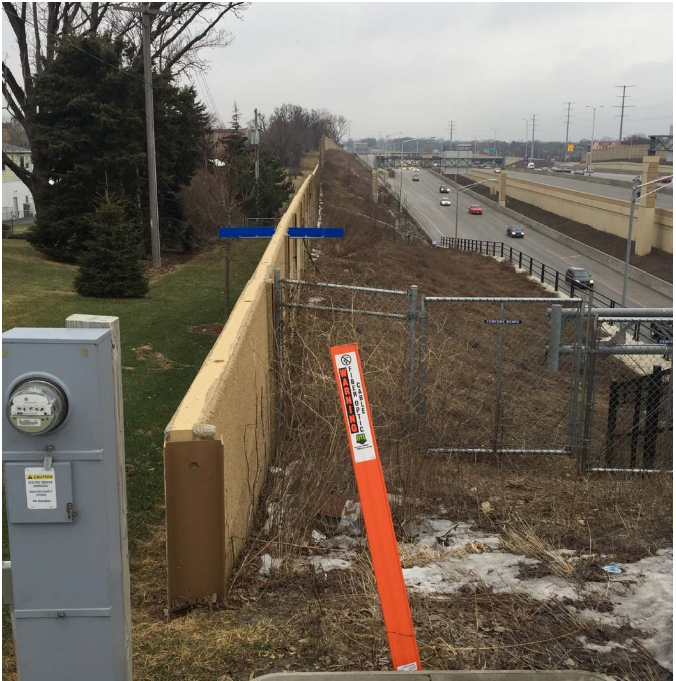
Photo 1 - The north portion of property from the northeast property corner, looking west.