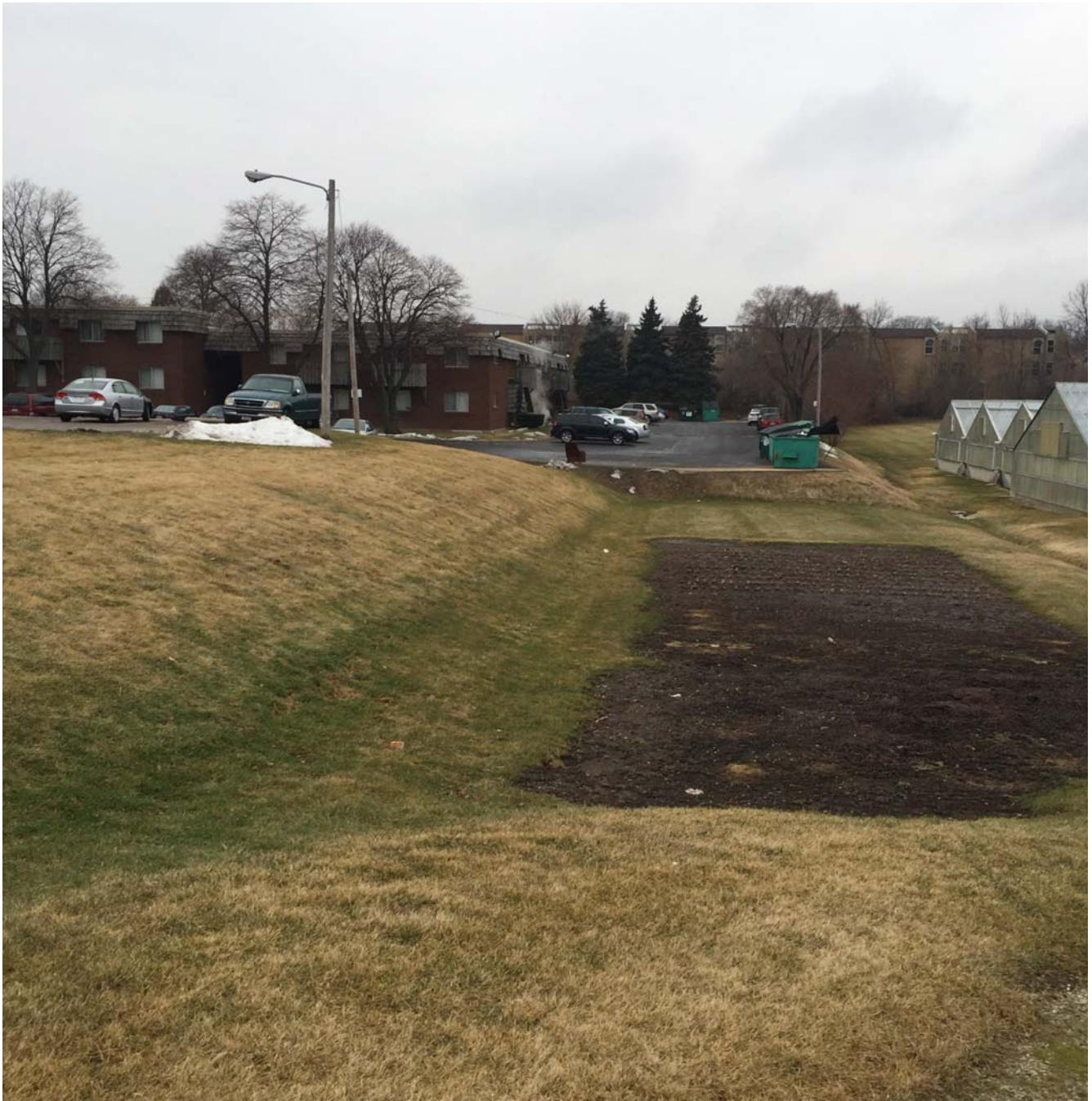
Photo 4 - The southwestern portion of property from the center of the southern property line, looking west.