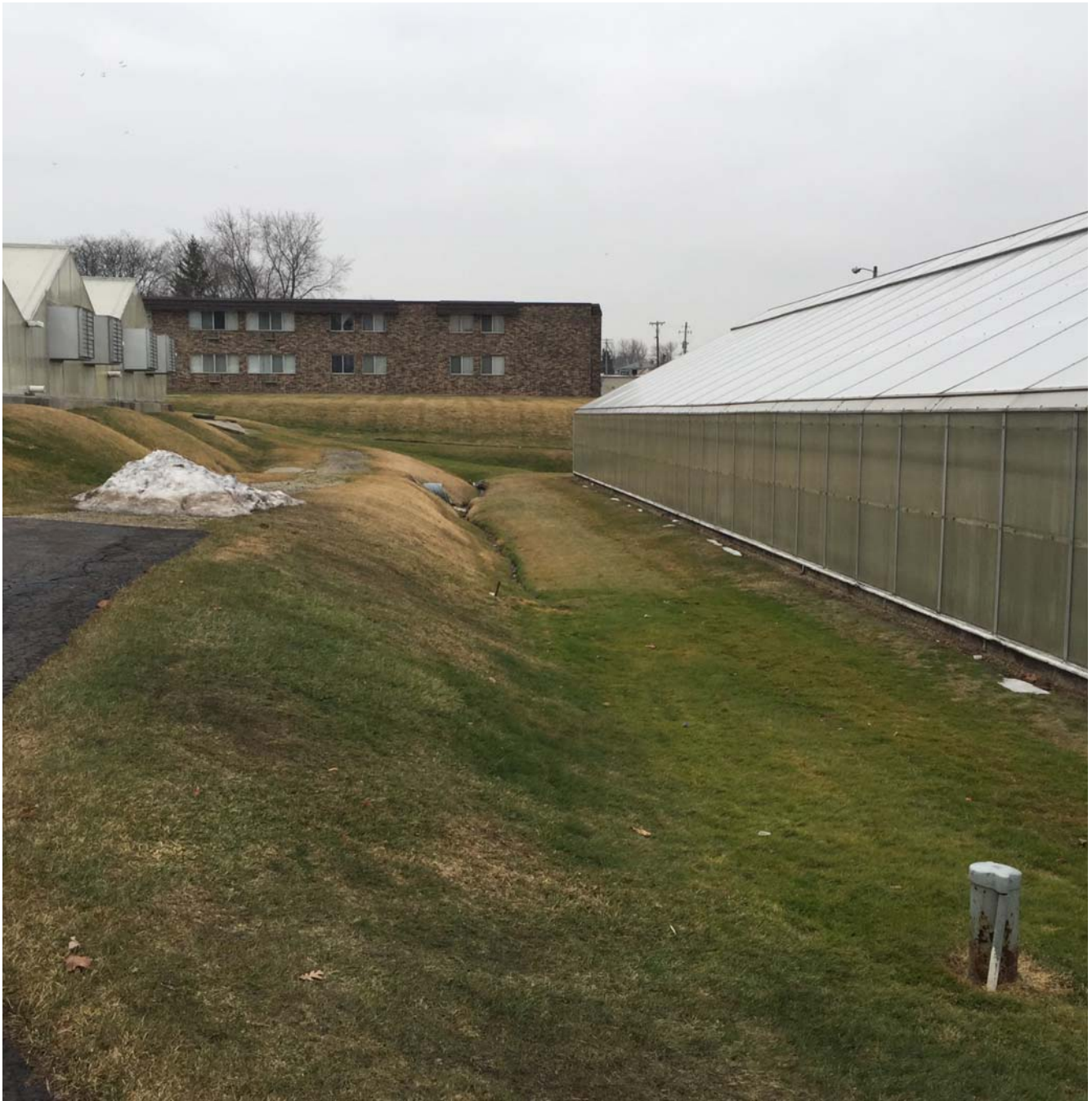
Photo 6 - The south central portion of property from the center of the property, looking south.