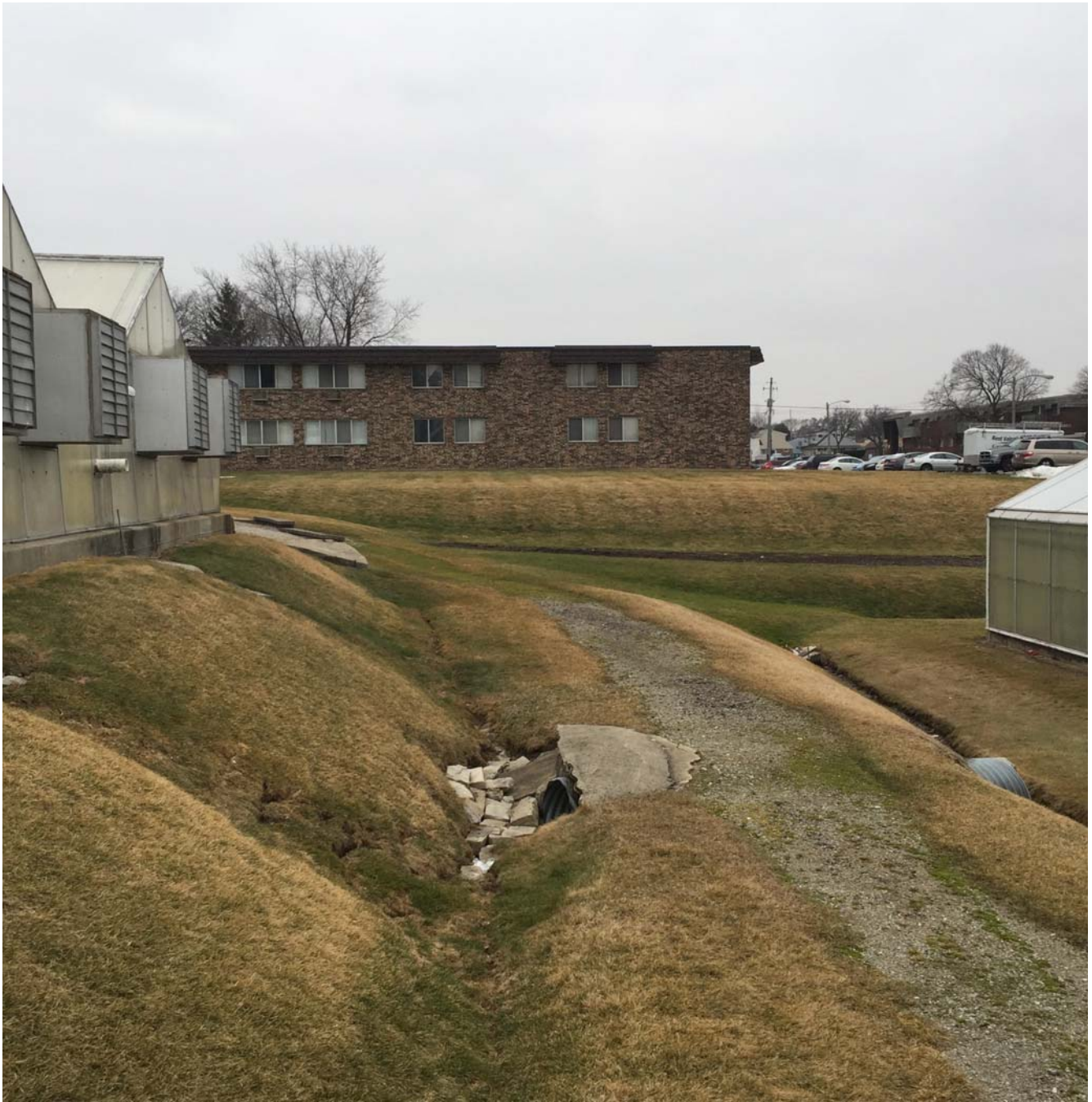
Photo 5 - The south central portion of property from the center of the property, looking south.