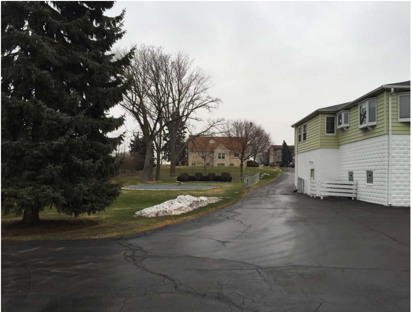
Photo 9 - The north eastern portion of the property from the center of drive, looking east.