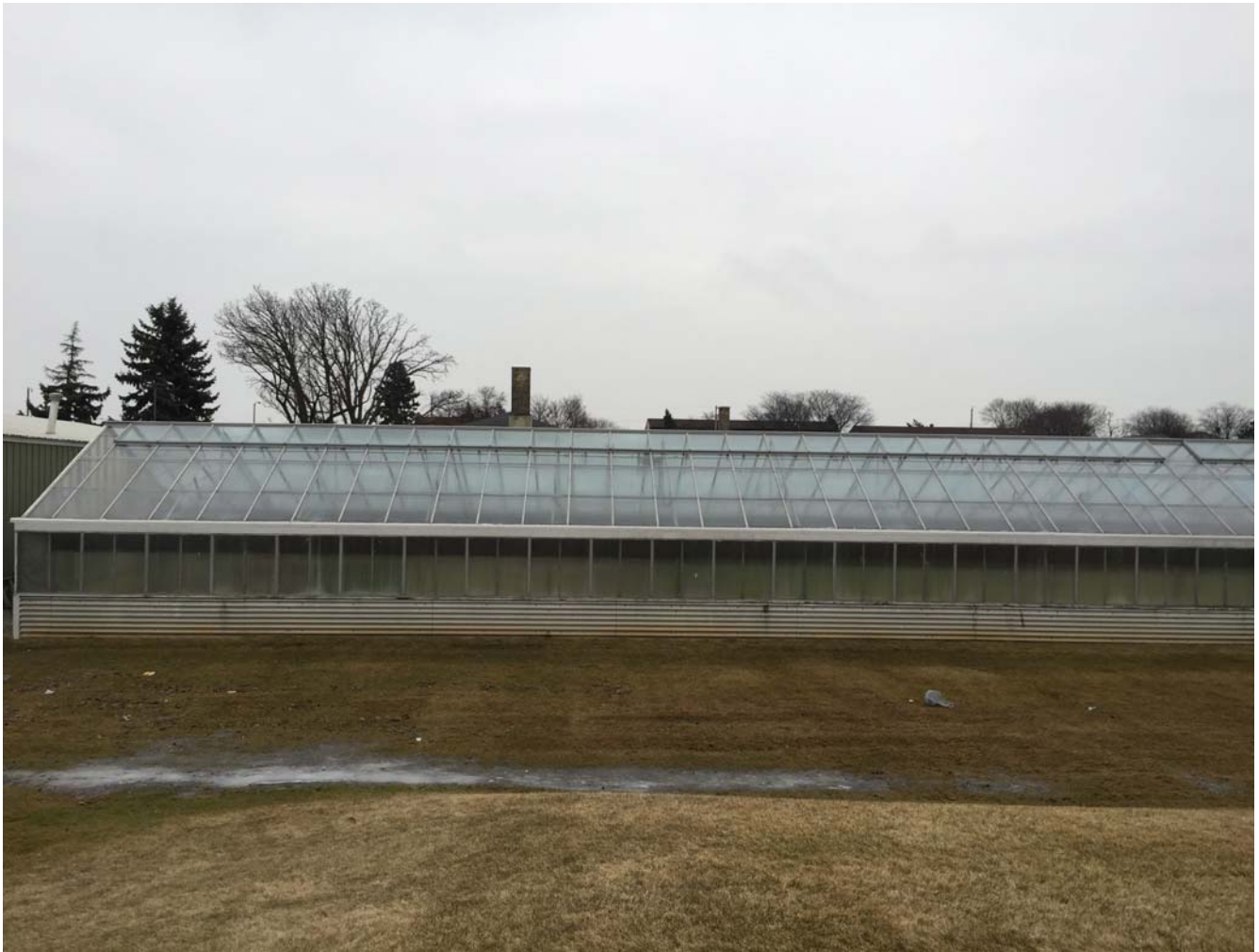
Photo 10 - The western portion of the existing greenhouse, looking east.