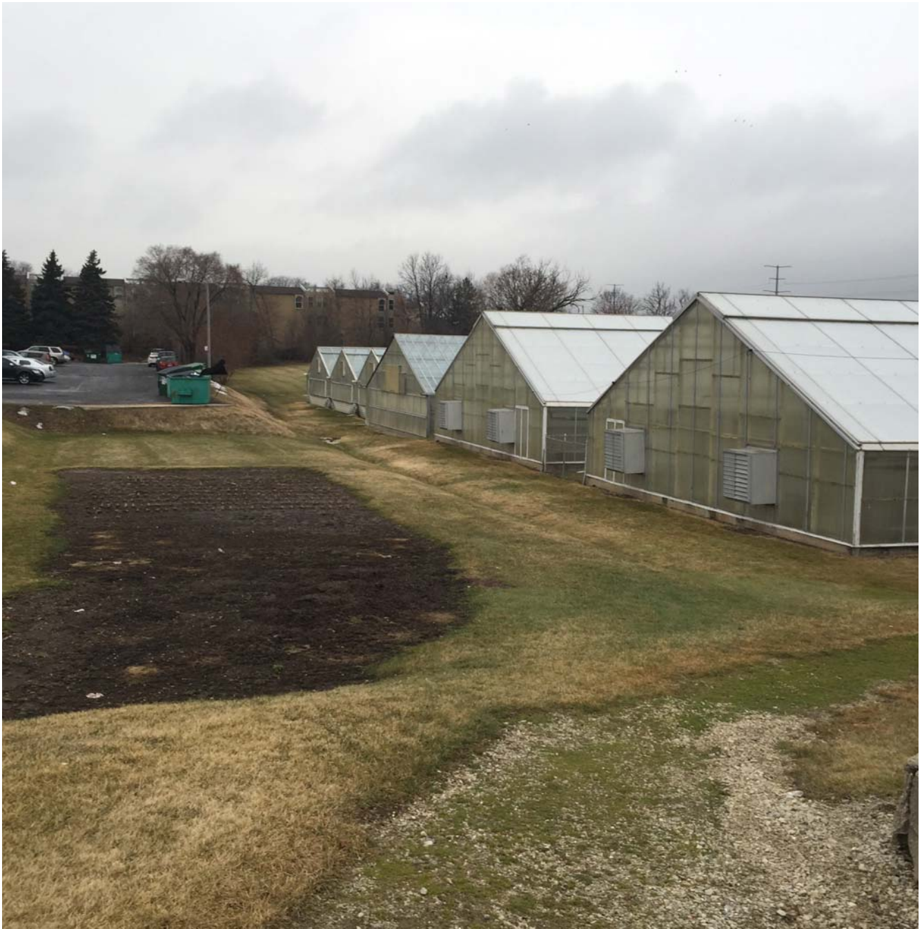
Photo 3 - The southwestern portion of property from the center of the southern property line, looking northwest.