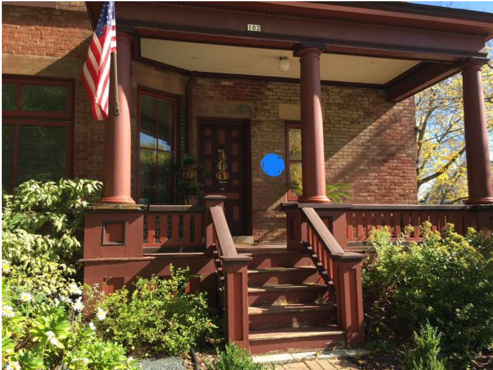
Plaque installation location