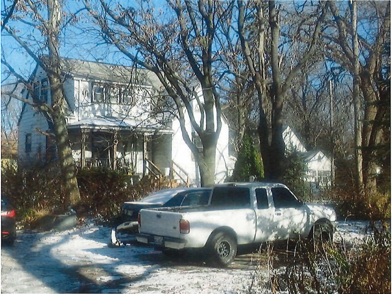
Above: Photo of the Subject Property (7020 W Mill Rd)