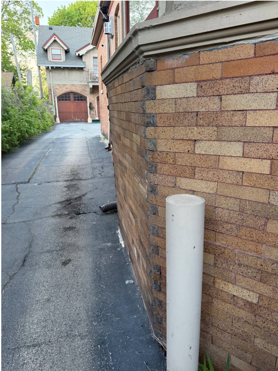
Wall to be rebuilt. Corner details will be replicated exactly as they presently appear.