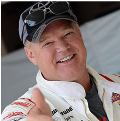
AL UNSER JR.