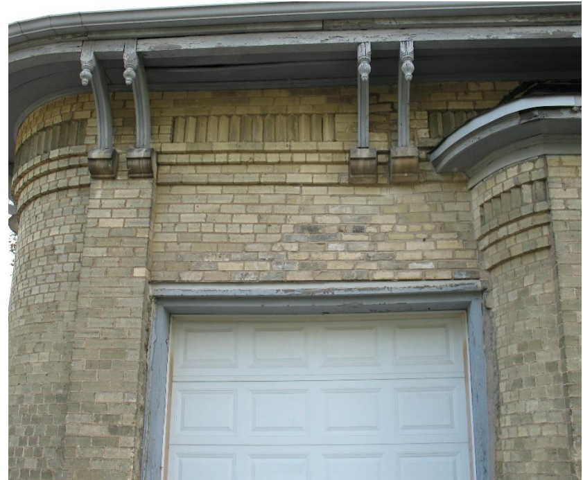
Lintel after repair