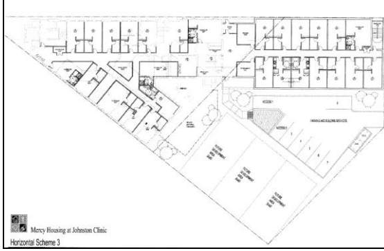
Preliminary First Floor Plan