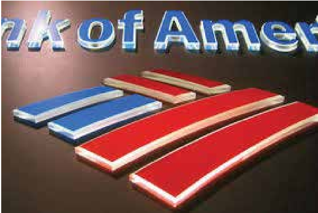
Examples of Acrylic Push Through