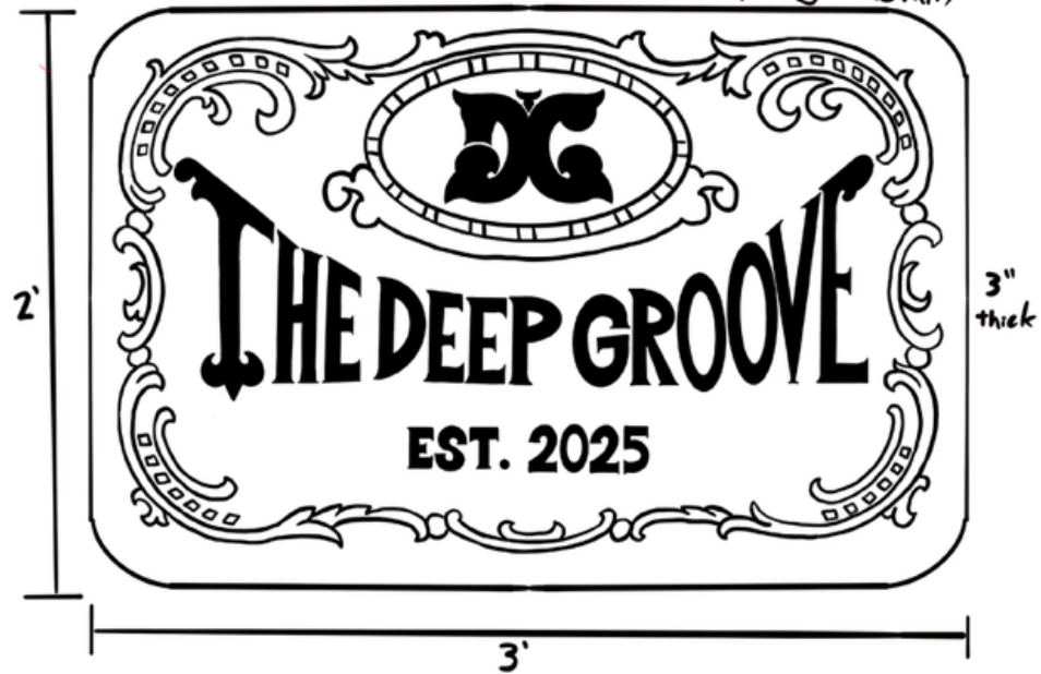
Projecting sign design and location