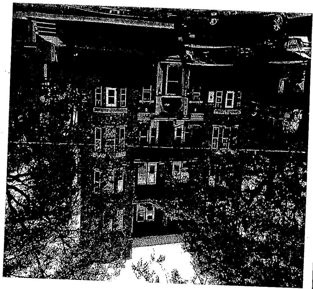
Present appearance after repairs