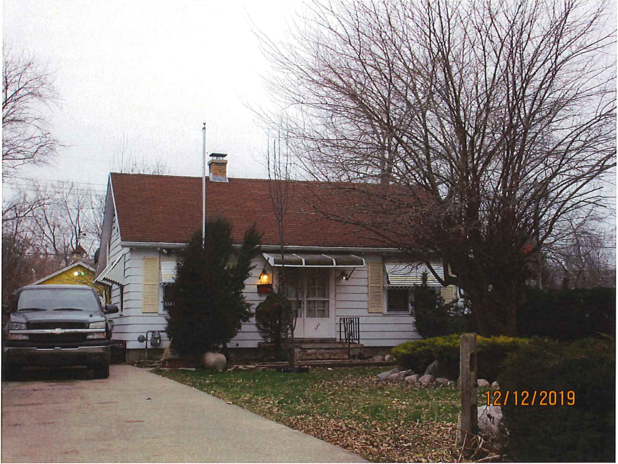
5043 North 54 th Street